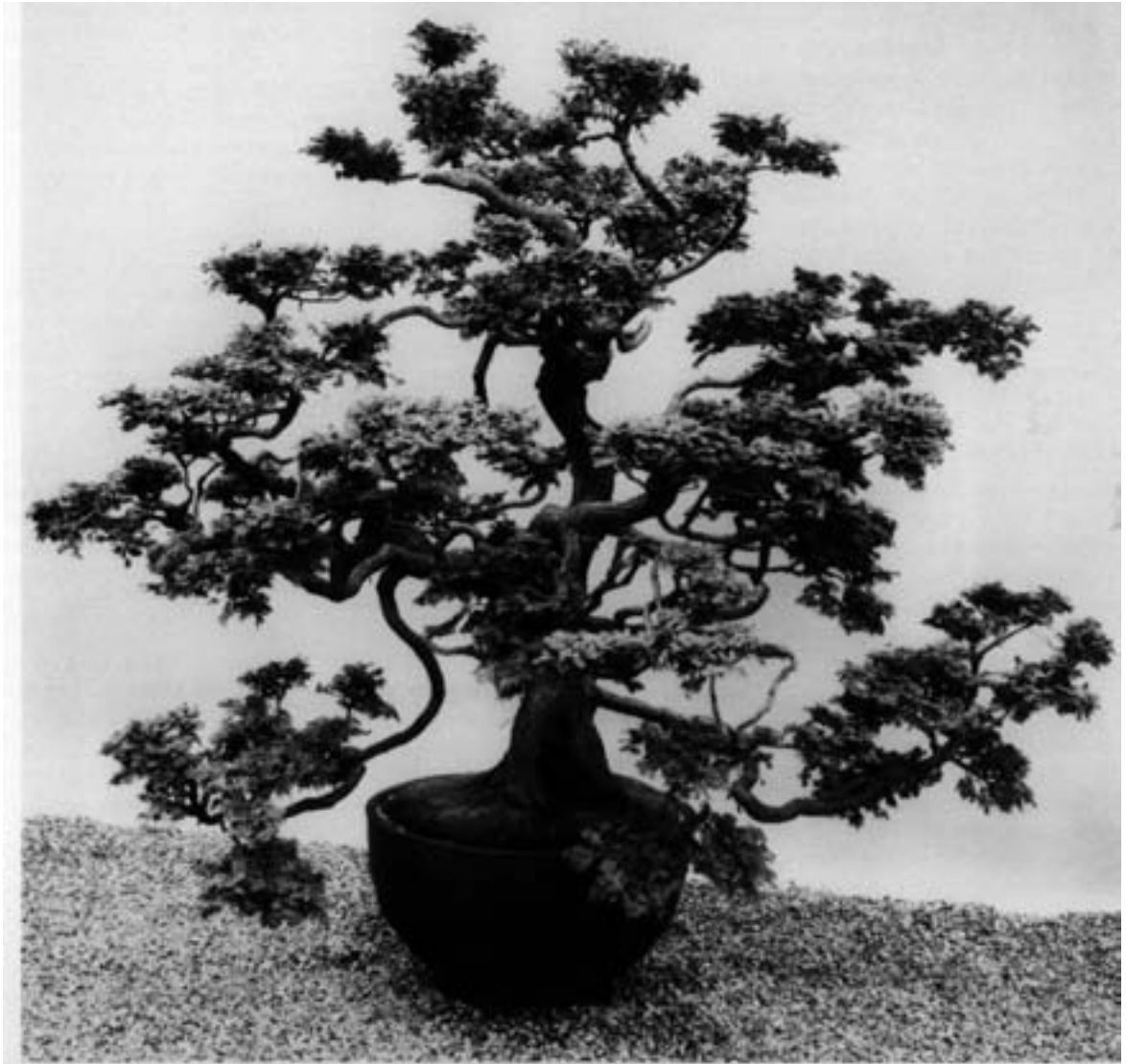
Chamaecyparis obtusa 'Chabo-hiba,' Compact Hinoki Cypress (#878-37), started in 1787. Top left , the plant in 1938. Bottom left , the plant in 1954. Above , the plant in 1989, 120 cm high (47 in). Note how the curved branch to the lower left of the plant has remained a constant feature over time.