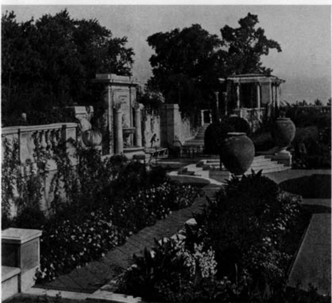
"The bosquet at the end of the garden, the pergola, flower draped, the marble balustrade, the wall fountain and the great Ludovisi jars." Note the parrot in the center of the picture. Illustration from the article on the gardens at Anderson's estate, "Weld," in the March 12, 1904, issue of Town and Country .

Larz Anderson's interest in things Japanese predated his assignment as ambassador to that country. In 1907, he built a Japanese garden at "Weld," and before that, in 1889, he