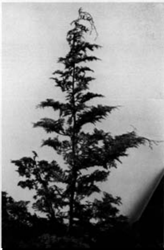
Chamaecyparis obtusa 'Chabo-hiba' #1100-71. This plant originated as a cutting from one of the old bonsai plants, but was left unpruned. At eighteen years of age, it is a meter and a half tall by a meter wide (60 in x 39 in).

Since the name Chabo-hiba is not in common use in Japan today, it took some work to uncover its exact meaning. By itself, the word hiba means hatchet-shaped (in reference to the foliage) and is the common name for the low-growing conifer Thujopsis dolabrata (Kurata, 1971) as well as for various horticultural varieties of Chamaecyparis obtusa and pisifera (Yoshio and Motoyoshi, 1891; Yoshimura and Halford, 1957). The word chabo literally means bantam chicken. In