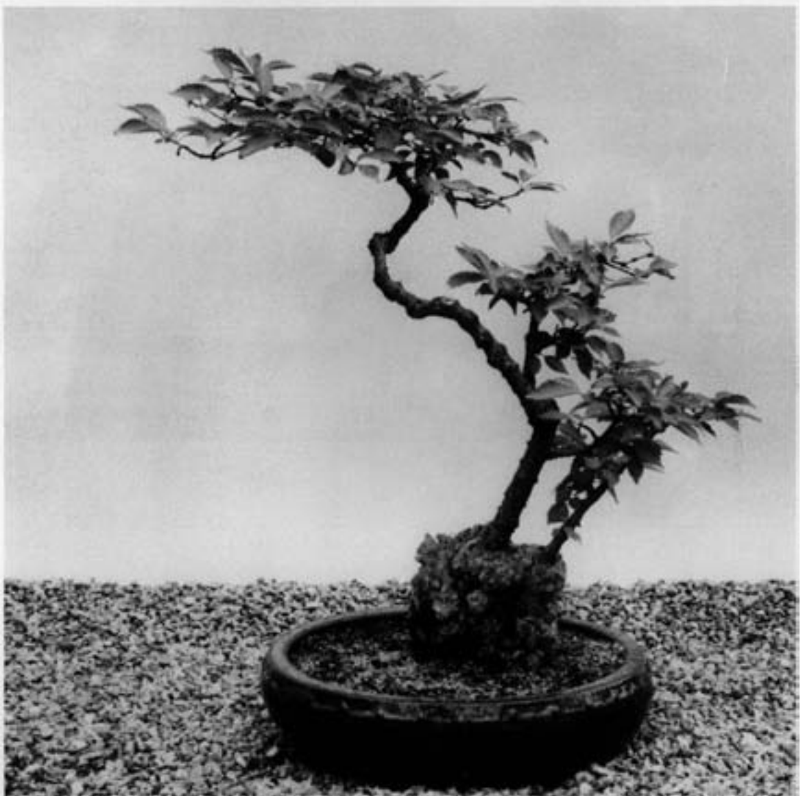
Prunus subhirtella , Higan Cherry (#889-37), started in 1852. Bottom left , the plant c. 1913, 61 cm high (24 in). Top left , the plant in 1965. Note the same pot as in 1913. Above , the plant in 1989, 50 cm high (20 in).