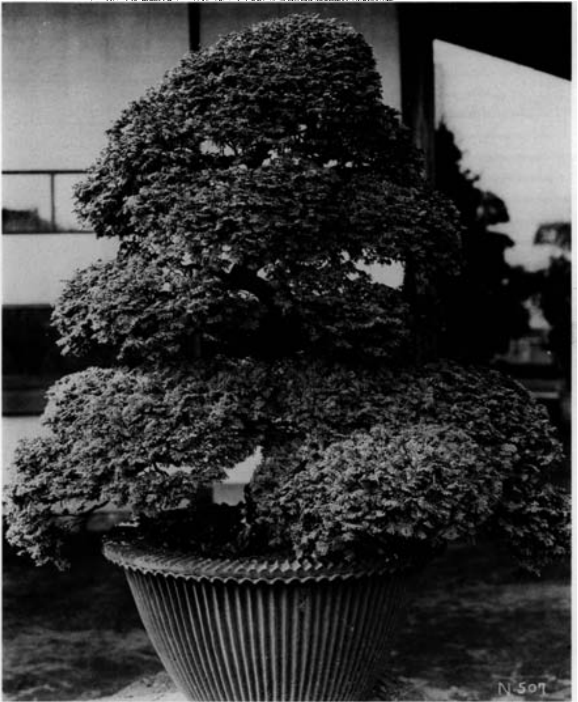
" Chamaecyparis obtusa var. nana Carr. Genuine dwarf tree about 70 years old. Value 50 yen. Grounds of the Yokohama Nursery Co., June 7, 1918."