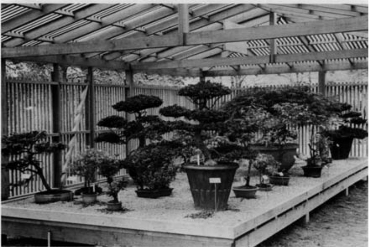
The Larz Anderson Collection of Japanese dwarf trees at the Arnold Arboretum, May 1938.

Unfortunately, the Larz Anderson Collection did not continue to get the attention of knowledgeable Japanese gardeners following its donation to the Arboretum. The staff did the best it could with its limited knowledge of how to take care of bonsai and the limited financial resources of the Depression era. Additional stress was put on the collection by the practice of periodically forcing it into early growth for the spring flower show of the Mas-