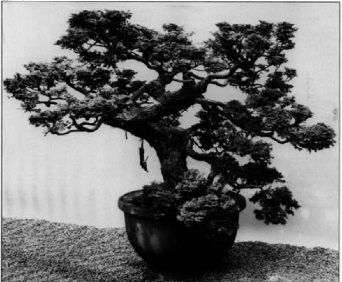
Chamaecyparis obtusa 'Chabo-hiba,' Compact Hinoki Cypress (#892-49), started in 1787. Left , the plant in 1952. Notice how the branches are tied to bamboo sticks to hold them in a horizontal position. Above , the plant in 1989, 160 cm wide (63 in).