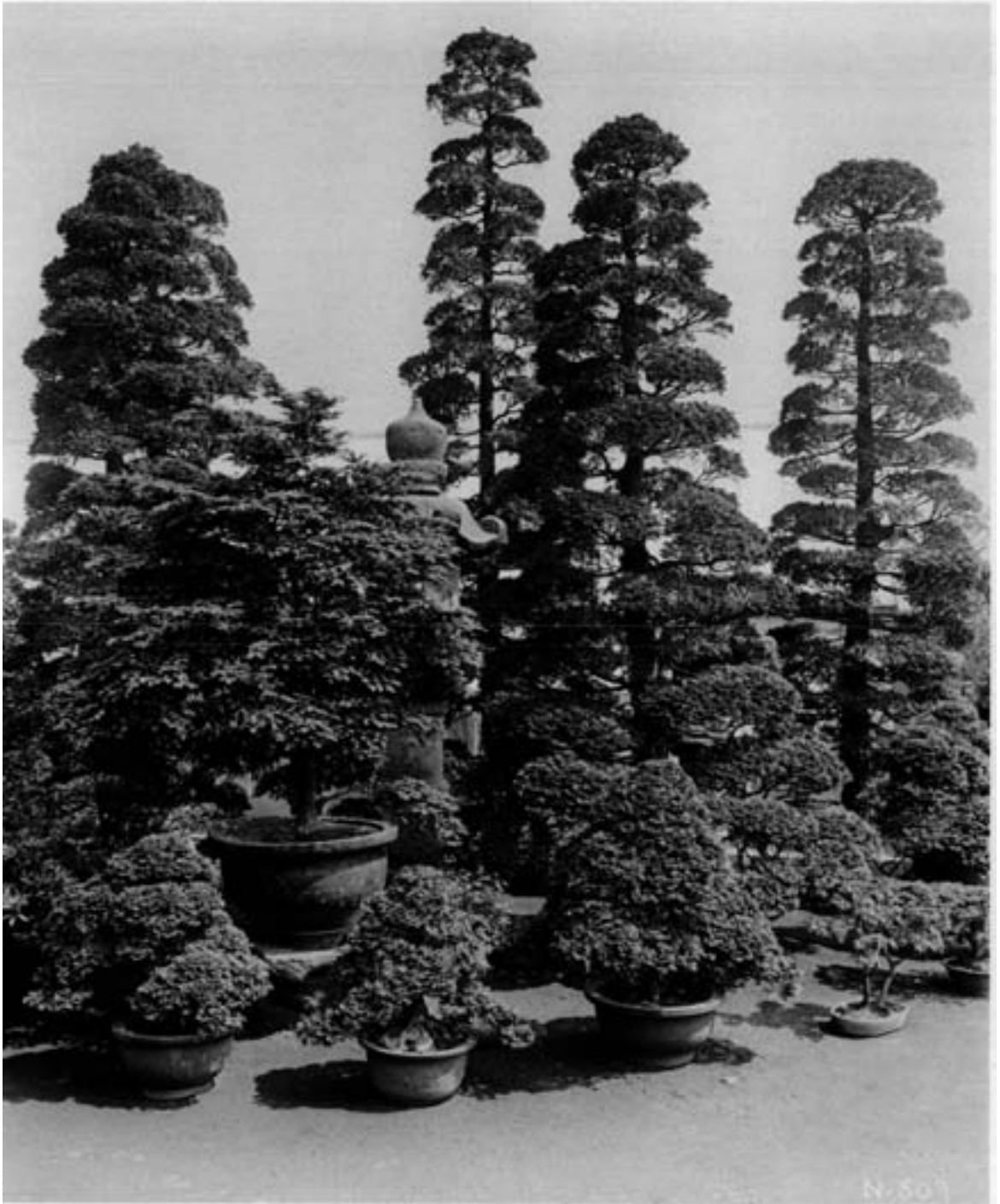
" Chamaecyparis obtusa var. nana Carr. Group of trained specimens. Tsuga diversifolia Maxim. in center. Grounds of the Yokohama Nursery Co., June 7, 1918."