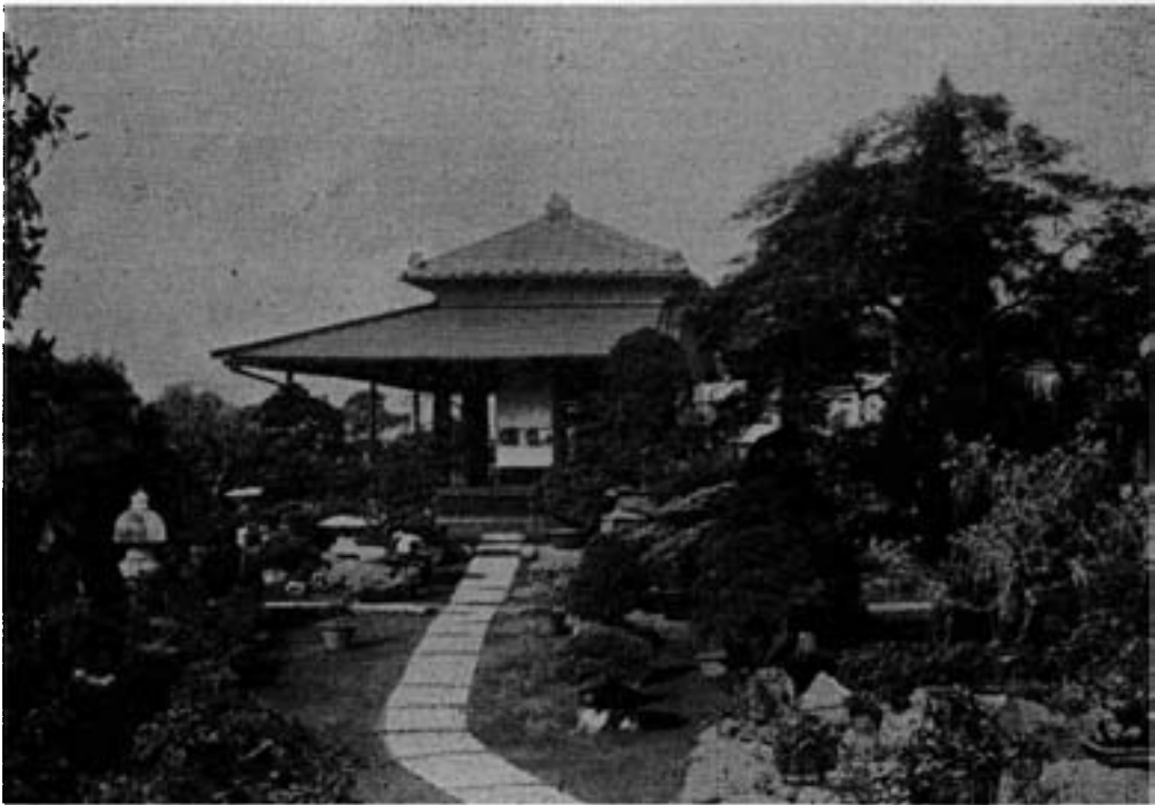
“Arbor of the Yokohama Nursery Company.” Illustration from the 1908 catalogue.

The part of Brookline where “Weld” was located, in the vicinity of Jamaica Pond, was one of the centers of American horticultural