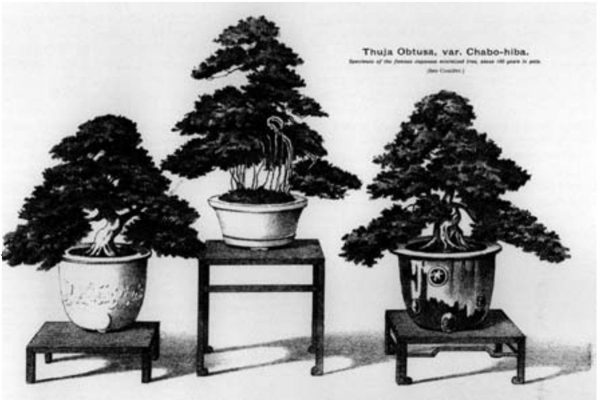
Illustration of Chamaecyparis obtusa 'Chabo-hiba' from the 1901 catalogue of the Yokohama Nursery Company.