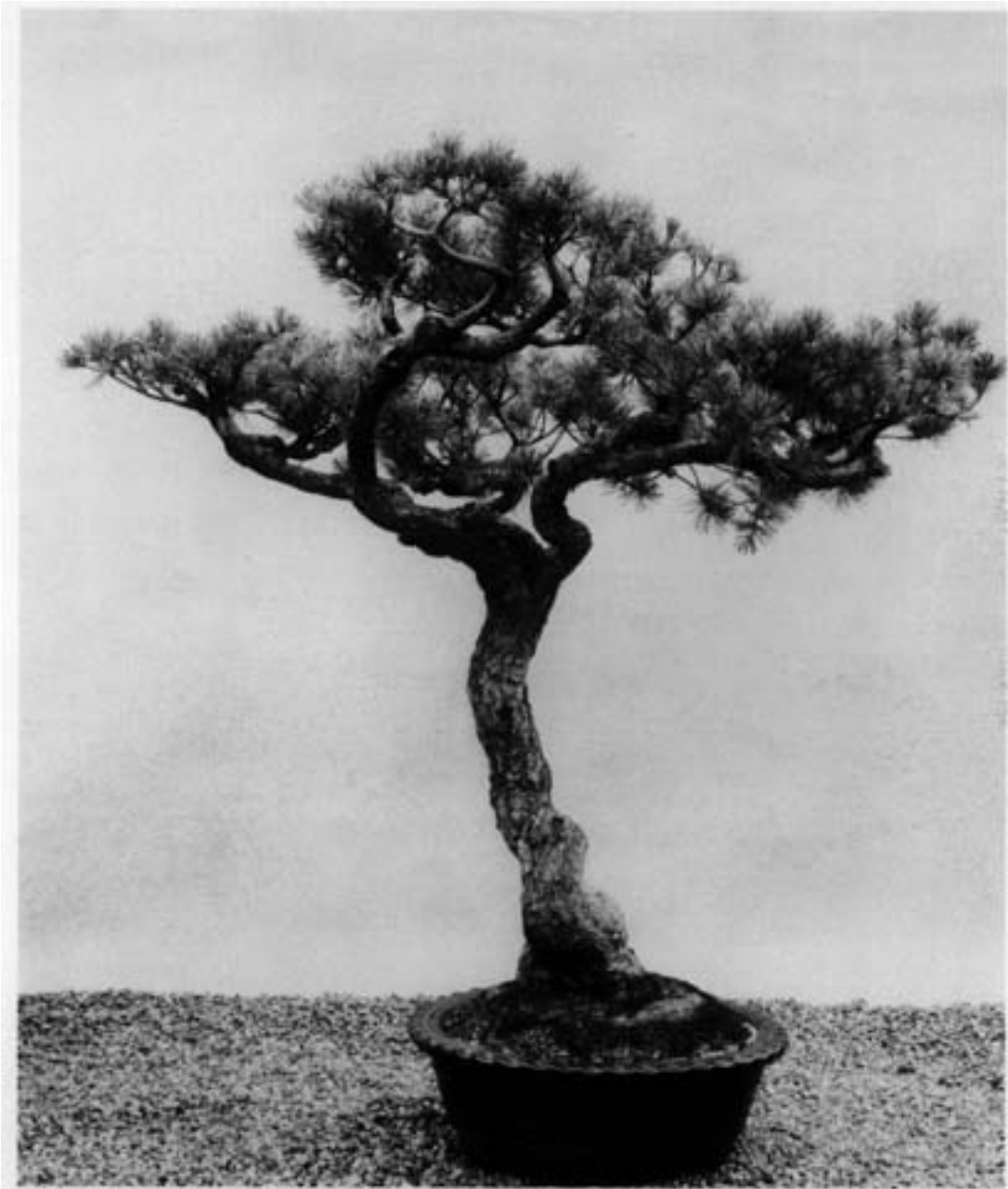
Pinus parviflora , Japanese White Pine (#893-49), started in 1887. Left , the plant in 1952. Note how bamboo sticks were used in training the branches. Above , the plant in 1989, 100 cm high (39 in).