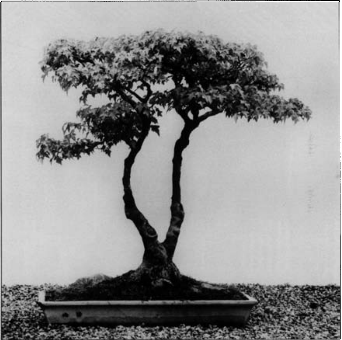
Acer buergerianum, Trident Maple (#870-37), started in 1852. Top left, the plant c. 1913, 58 cm high (23 in). Bottom left, the plant in 1933. Above, the plant in 1989, 70 cm high (28 in). Note how the plant has remained in the same container for over 75 years.