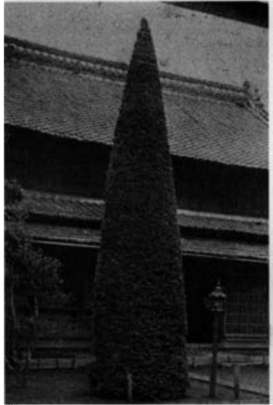
“ Thuja obtusa compacta .” Illustration from the 1914 catalogue of the Yokohama Nursery Company.

The historical record leaves little doubt that the Larz Anderson hinokis are best referred to as Chamaecyparis obtusa ‘Chabo-hiba,’ defined here as a compact, slow-growing cultivar with dark green foliage that develops a pyramidal shape over time. Often grown in containers and intensively pruned, it responds to such treatment by producing congested,