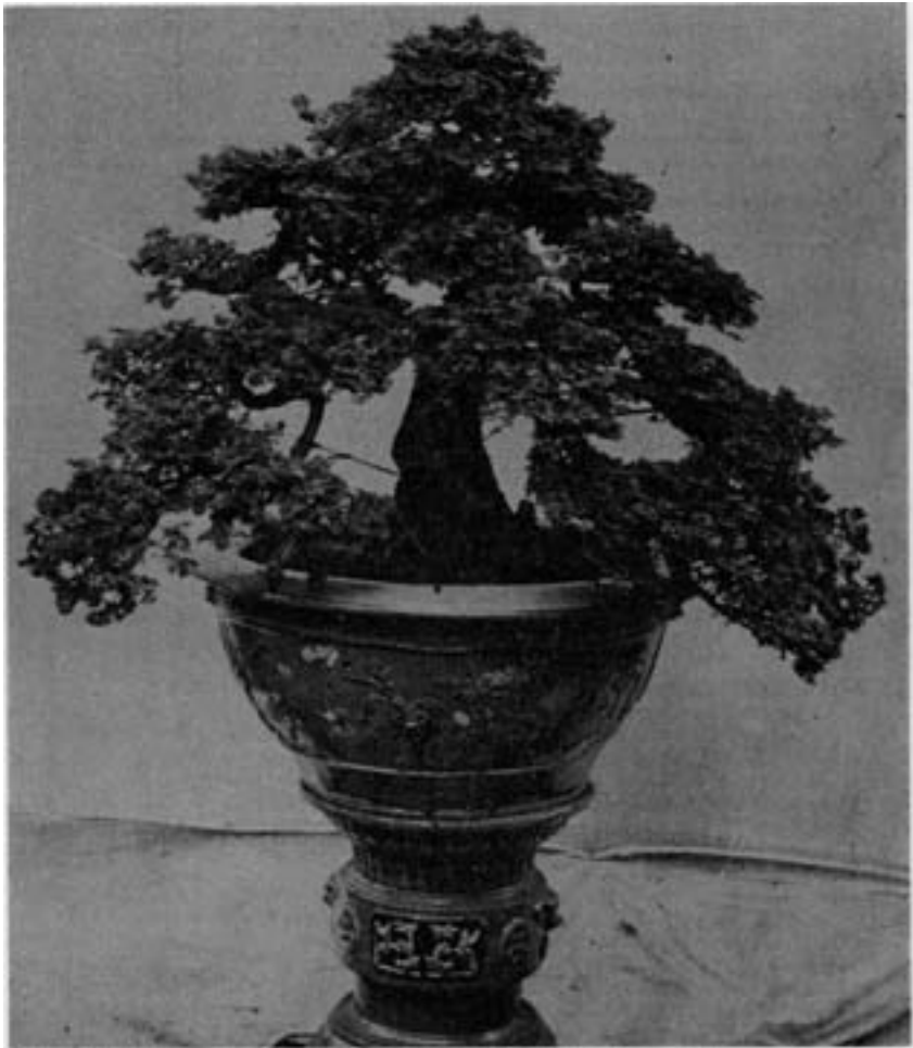
Item #340 from the 1904 auction catalogue of the S.M. Japanese Nursery Company. The description reads: "Chabo-hiba. One of the most imposing-looking specimens in this collection. This grand tree once belonged to the famous temple Hongauji, Kyoto, the ancient Capitol of the Japanese Empire. It has been said that owing to its most attractive shape, this specimen was admired by almost a million people, who made the pilgrimage to this noted temple of Buddha. It was trained by the several master gardeners who gave their services to the temple. Trained in the standard Jikka style. Note: its most graceful branches extended into both sides. About 100 years old; height, 2 feet, 6 inches. With Chinese pottery pot on stand."

FERTILIZING: While the instructions provided by the Yokohama Nursery call for fertilizing the plants with powdered oii cake (consisting of soybean or rapeseed, after the oil has been pressed out) or bone meal, we use a chemical fertilizer solution diluted to a concentration of approximately 0.01 percent