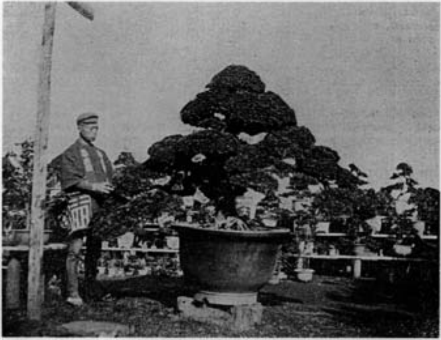
"A rare specimen of dwarfed Thuja obtusa (400 years old). A relic of the Tokugawa Era." Illustration from the 1905 catalogue of the Yokohama Nursery Company.