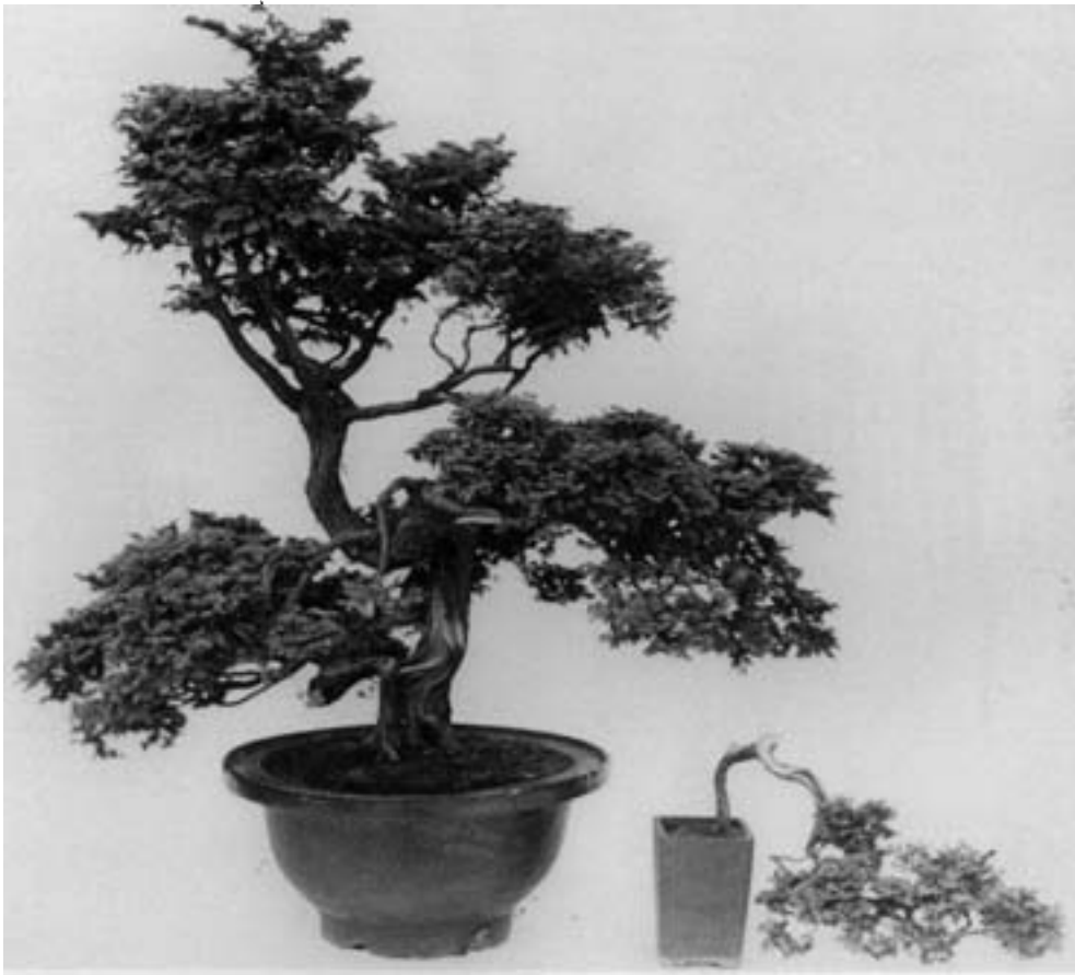
Chamaecyparis obtusa 'Chabo-hiba', Compact Hinoki Cypress. (#879-37), started in 1802. Top left , the plant in 1963. Above , the final result of a successful operation performed by Connie Derderian in 1969. As she describes it, "A lower branch had split away from the main trunk of 879-37. Rather than cut it off and lose it, a wedge-shaped piece of soil was cut away from the root ball to create a new plant. It was put into the container on the right." Bottom left , the lower branch (#101-69) in 1989, 60 cm wide (24 in).