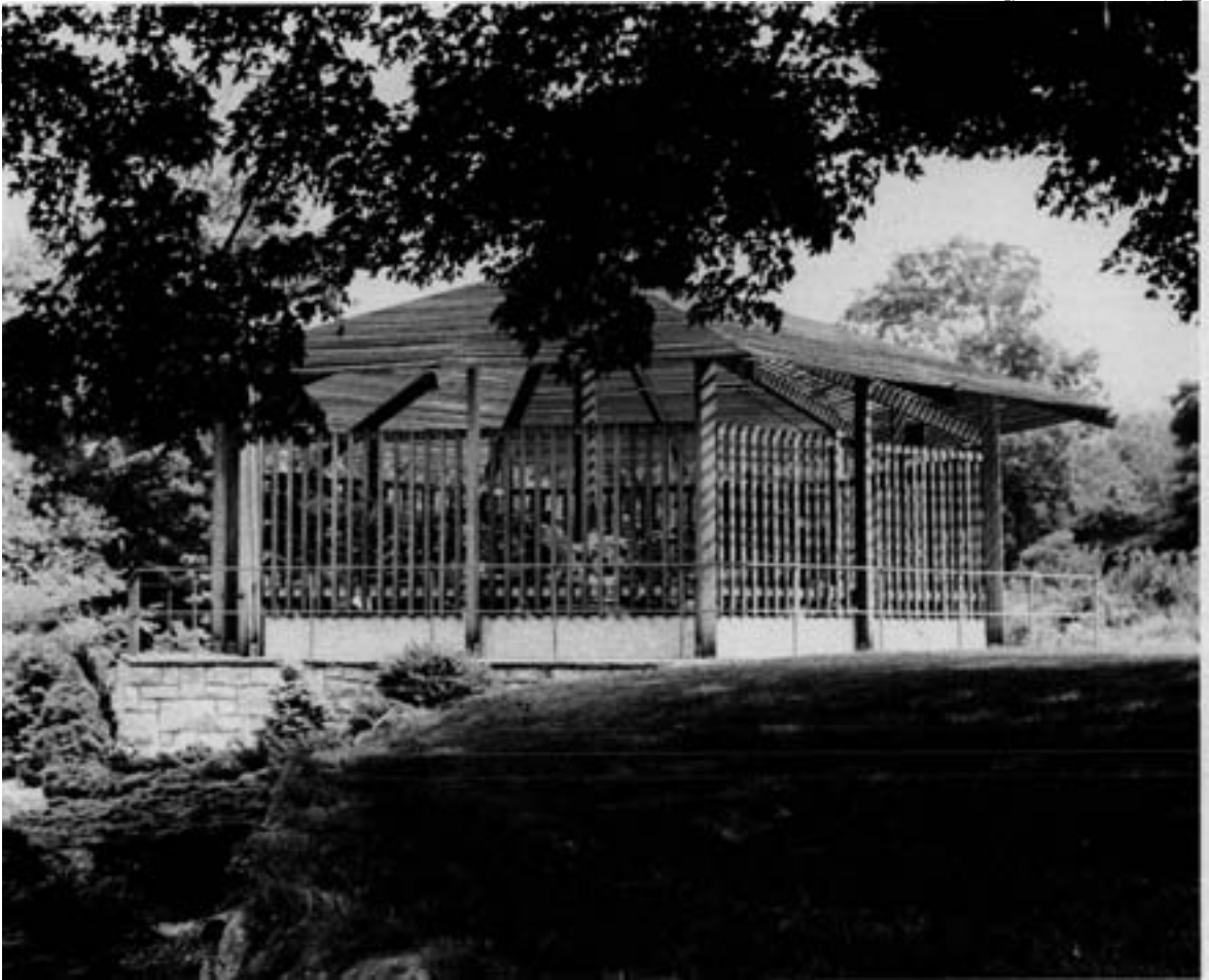
The bonsai house at the Arnold Arboretum, completed in 1962.

require more than this. Extending this need for daily watering back into the past some two hundred years, one begins to appreciate the magnitude of continuity and commitment that has gone into maintaining these venerable specimens.