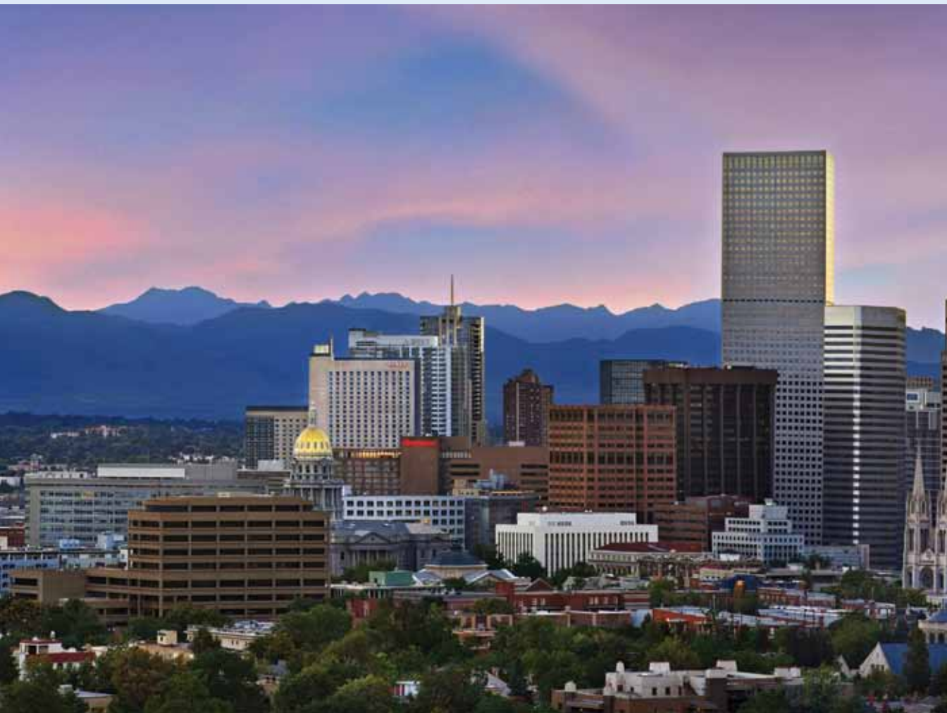
DENVER SKYLINE AT SUNSET