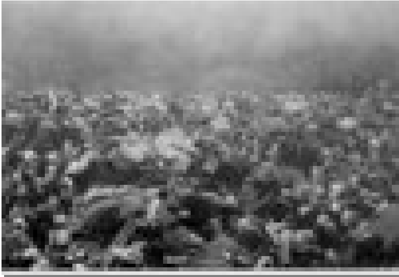
Figure 1: 1923 Earthquake Kills 300,000 Japanese, Wounds 500,000