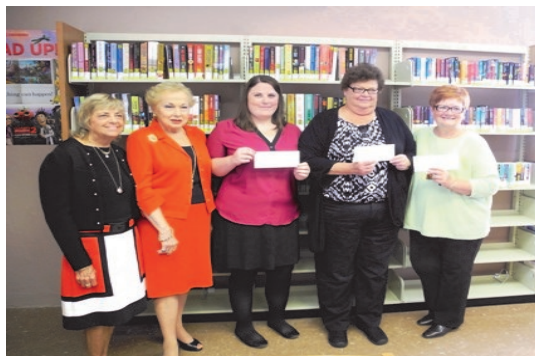
Monmouth County librarians receiving checks from the Rebuilding Our NJ Libraries Fund

Three Monmouth County libraries damaged in Hurricane Sandy ( Oceanport , Sea Bright , and Monmouth Beach ), recently received donations from the Rebuilding Our New Jersey Libraries fund. The fund was created by NJLA with over $13,000 in donations received from people all over the country (and from as far away as Scotland) who wished to help New Jersey libraries after the superstorm. The money raised is being equally distributed to seven total libraries in the state that were damaged. Each library received $1,942.