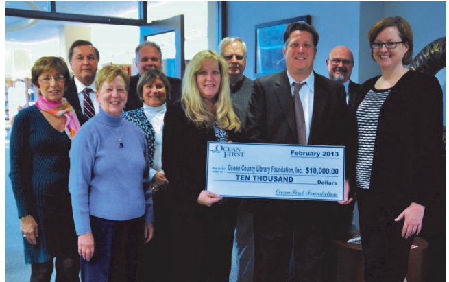
The Ocean County Library Foundation receiving a donation from Ocean First Foundation in February.

Our foundation undertakes a variety of fundraising and