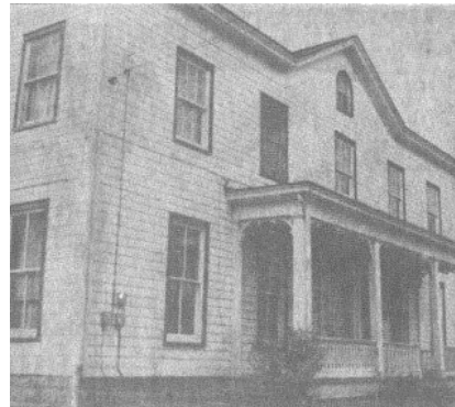
First site of Hackettstown Library

Hackettstown PL celebrated its 100th Anniversary in September.