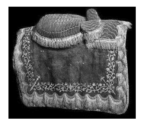
Figure 2 - Typical Saddle from 19th Century

Neither did we eat any man's bread for nought; but wrought with labour and travail night and day, that we might not be chargeable to any of you: