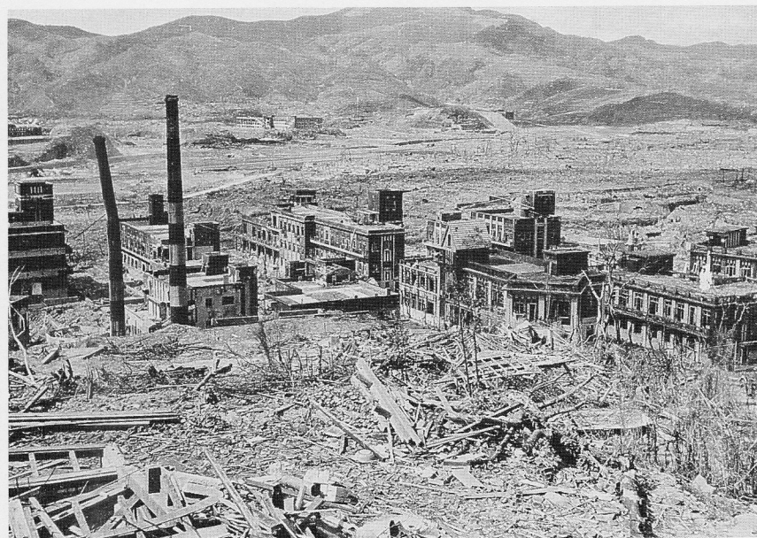
The Ruins of Urakami Catholic Church (upper panel) and Nagasaki Medical University (lower panel).