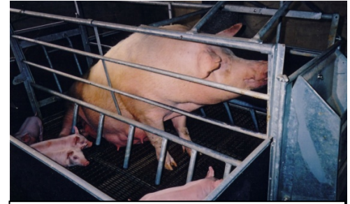
Farrowing crates are used for sows about to give birth and until weaning.

At 3-7 days prior to giving birth, sows are moved to farrowing crates. Like sow stalls, farrowing crates consist of a steel cage that completely surrounds the sow, not allowing her to walk more than a couple of steps or turn around. The bare concrete floors usually have a slatted area at the rear for dunging or the crates are fully slatted. In some systems, litter material such as wood shavings may be provided to reduce the risk of the sow slipping and crushing her piglets. Heated creep areas (hide areas) are usually provided for the piglets and these encourage the piglets to lie away from the sow, this prevents piglet crushing (see below).