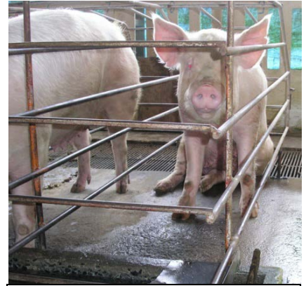
Sow stall – used for pregnant sows throughout their gestation period. A few days before they are due to give birth, they are moved to a farrowing crate.

At breeding time, dry sows and gilts are introduced into a small pen that contains a single boar, who then mates with them ('serving'). This may be repeated if they do not become pregnant. Pigs are examined with ultrasound to confirm pregnancy, about one month after mating. Artificial insemination (AI) can also be used whereby boar semen is introduced manually into the sow by the stockperson (caretakers). Once mated, both gilts and dry sows are kept in either 'sow stalls' or 'tether stalls' (see below) during their pregnancy which lasts for about 114 days (3 months, 3 weeks and 3 days). Stalls are used to maximise the number of animals that can be housed in a given area. Stalls also prevent the sows from fighting each other and make it easier to manage the sows (e.g. provide veterinary treatment) with fewer stockmen.