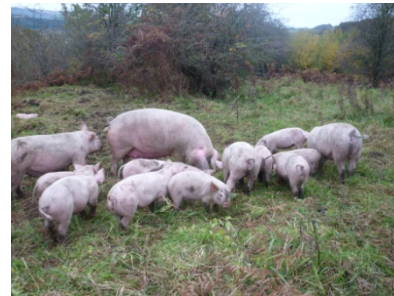
Outdoor (extensive) pig farming