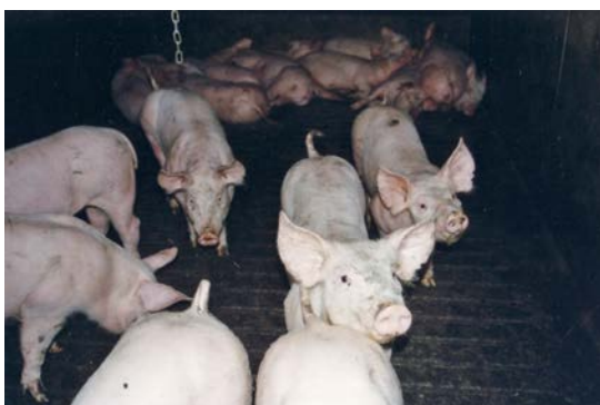
These rearing pigs are housed in pens with fully slatted floors without any enrichment, except for a single chain which is not sufficient enrichment.

The EU Pig Directive requires that all pigs must have permanent access to manipulable material to enable proper investigation and manipulation activities 25 . Enrichment objects or well-designed pig ‘toys’ can be provided, if pens have part-slatted floors. Bedding (straw or other materials such as saw dust or rice hulls peat, compost, and various wood chips 26 , has the highest potential to provide successful enrichment 27 .