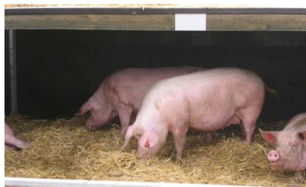
Higher welfare systems for pigs provide an environment that allows pigs to perform more of their natural behaviours.

Pigs can be kept in a range of alternative farming systems. Traditional breeds, such as Tamworth, Saddleback, Gloucester Oldspot, Pietrain, Iberian and Meishan, or their crosses, are often used in these systems. These breeds tend to have smaller litters of 6-8 piglets and farrow only once or twice a year. Although they have fewer litters than modern breeds, they usually have better mothering abilities. These pigs also take longer to reach slaughter weight (at 36 weeks of age), but the meat quality is perceived to be better. Modern breeds, such as the Large White and the Duroc can also be reared in less intensive systems. These breeds are bred throughout the year and will have larger litters similar to when they are kept in the more intensive systems.