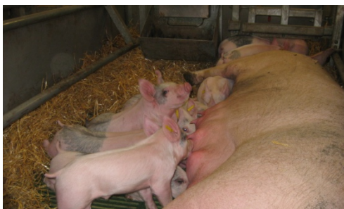
Free farrowing systems do not restrain the sows during or after farrowing.

Arks/huts: outdoor systems use individual farrowing 'arks' or huts that are deep-bedded with straw. Although there can be higher piglet mortality when the weather is extremely cold and wet, UK figures show that outdoor systems can rear the same number of piglets as farrowing crates 36 . Organic farming 37 is based on outdoor farrowing systems.