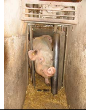
A sow is entering an electronic feeder. The sow can only enter with her individual transponder attached around her neck.