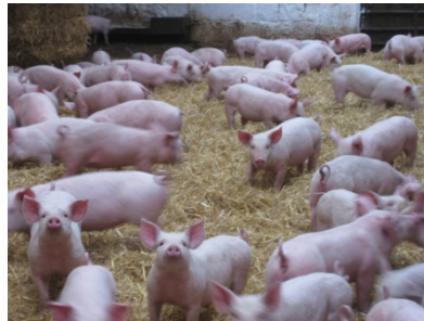
Enriched indoor pig farming