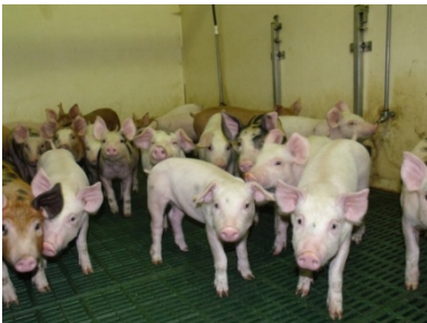
Intensive pig farming

In some parts of the world, notably Spain, Sweden and Brazil, pigs are allowed to roam freely in semi-natural enclosures.