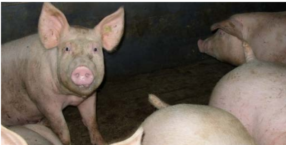
Pigs with docked tails no longer have their curly tail. Tails are commonly docked in barren systems to prevent wounds from pig's biting each other's tails.

Within a few days after birth, piglets are given a series of vaccinations. A number of mutilations are carried out without any sedation or pain relief, including: