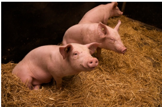
Weaners in enriched indoor systems are housed in pens with solid floors and bedding, allowing them to perform more natural behaviours like foraging and exploring.

In most alternative systems, weaners are kept in indoor pens. This is because they are less able to cope with environmental (weather) extremes. Even in organic farming, weaners are generally kept indoors. Pens usually have deep bedding. In different parts of the world, different substrates have successfully been used as bedding including straw, wood shaving, rice hulls and peanut straw.