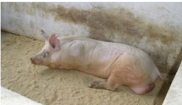
Boars are normally penned alone.

Boars are generally kept singly in pens. This is partly to prevent aggression and partly to ensure paternity of offspring (so that the farmer knows who has fathered a litter). The pens are usually also used for mating. Bedding is often provided to ensure good foothold for the boar during mating. On some farms boars are kept in pens with slatted floors and in some countries they are kept in sow stalls and only removed for mating. Boars may have their tusks trimmed 17 to prevent injuries to stockpersons and other pigs. It is recommended that this procedure is carried out by a vet using an orthopaedic saw once the boar has been sedated. However, the procedure is often carried out