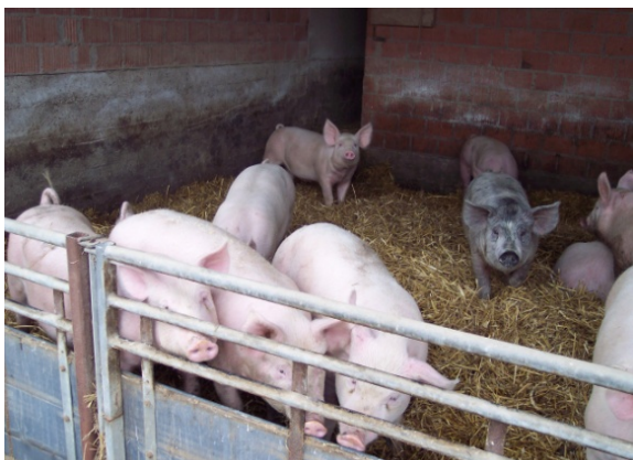
Pigs in higher welfare systems have more space and enrichment, such as straw bedding.

Rearing pigs are kept in a variety of different husbandry systems. Most rearing pigs tend to be kept indoors. This is because if they are kept outdoors on pasture, they will root it all up. Paddocks are soon turned into giant mud baths. In some countries, the pig's ability to clear the land has been put to good use. Farmers in the UK and Sweden have used pigs to 'plough' the land after harvest and also clear woodland after it has been felled.