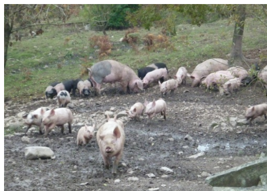
Extensive pig farming requires a lot of land to allow for rooting behaviour.

Rearing pigs can be kept outdoors on pasture or woodland as long as there is plenty of space and/or frequent rotation. In Andalucia (Spain), the tradition of keeping Iberian pigs in extensive oak woodlands still survives. The pigs forage on acorns and benefit from living in a near natural-habitat. However, males are still castrated and many have nose rings to discourage rooting.