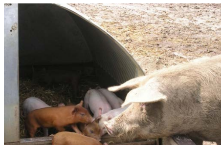
Arks are used in outdoor systems and provide shelter during adverse weather conditions.