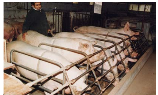
Tether stalls where sows are kept during their pregnancy, and tethered with a chain or strap

be reduced during late pregnancy to reduce the risk of obesity. This can lead to hunger.