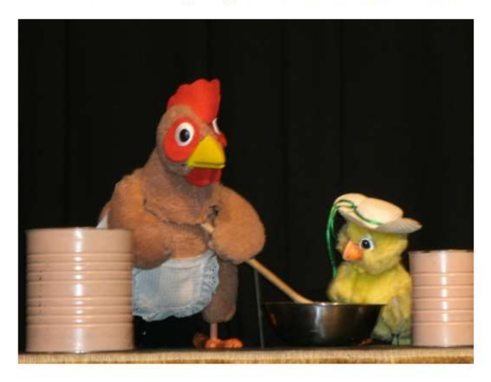
They ate the _____ e a d.