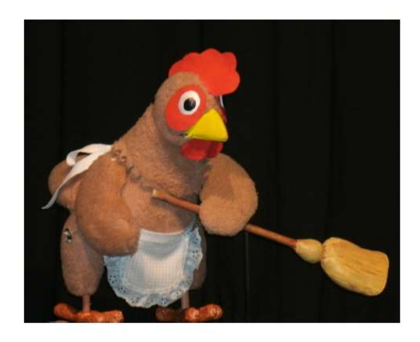
They planted the w h e a ____ and took care of it.

The Little Red Hen used a ____ o o m to ____ e e p.