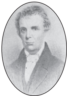
Barton W. Stone

which we bless; is it not the joint participation of the blood of Christ? The loaf which we break; is it not the joint participation of the body of Christ? Because there is one loaf, we, the many are one body: for we all participate of that one loaf.”