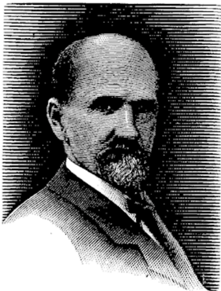
CAPTAIN JOSHUA SLOCUM

On April 24, 1895, Captain Joshua Slocum set out on his voyage that was to become the first solitary circumnavigation of the globe. His account of this enterprise [8], has become a classic. Figure 2 shows a portrait of Slocum from the 1949 edition.