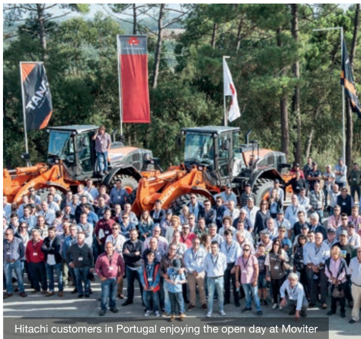
Hitachi customers in Portugal enjoying the open day at Moviter

"These events are important because they not only show our organisational qualities and capabilities, but also demonstrate Moviter's determination to take the lead on innovation. They allow us to get to know our customers' businesses better, so we can see where synergies exist and develop solutions that answer their specific needs."