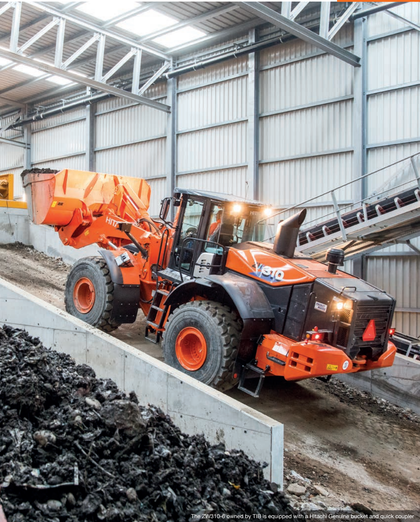
The ZW310-6 owned by TIB is equipped with a Hitachi Genuine bucket and quick coupler