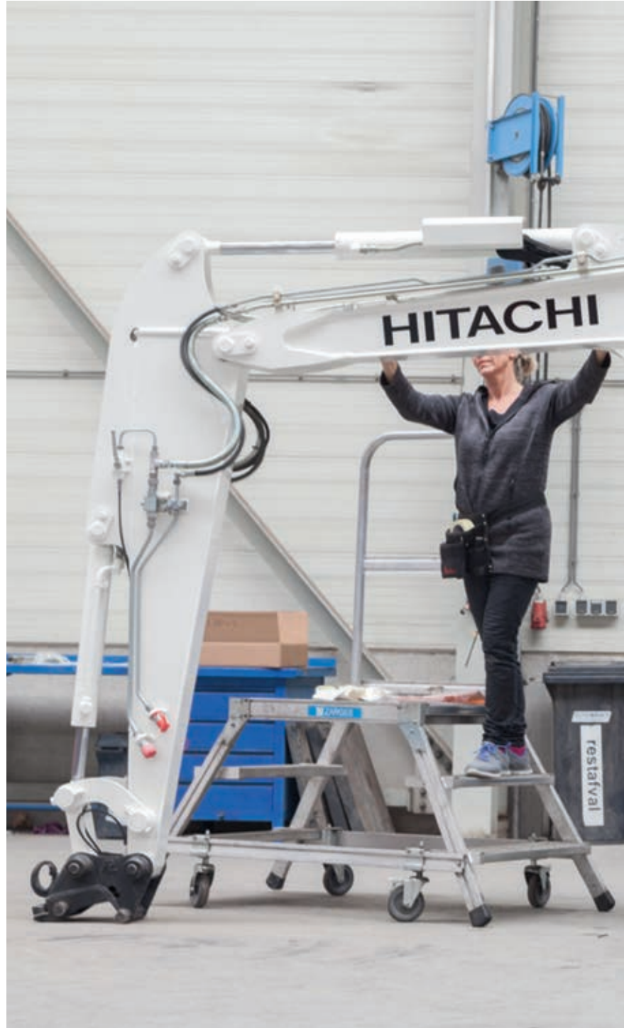
The ZX38U-5 was repainted as part of the Premium Used process

The three-year-old machine had approximately 2,000 working hours when it was selected for the programme. Generally in good condition, it required little refurbishment by the technicians at HCM Nederland.