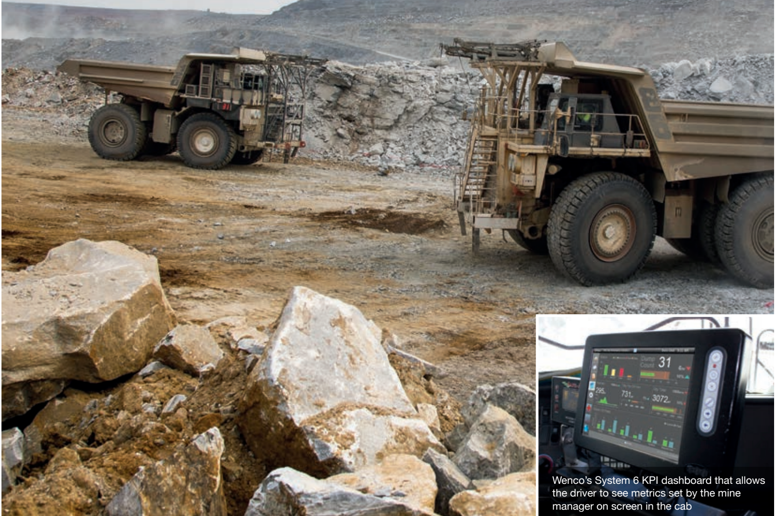
Wenco's System 6 KPI dashboard that allows the driver to see metrics set by the mine manager on screen in the cab