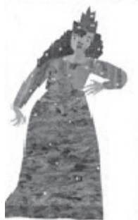
Queen of the Night