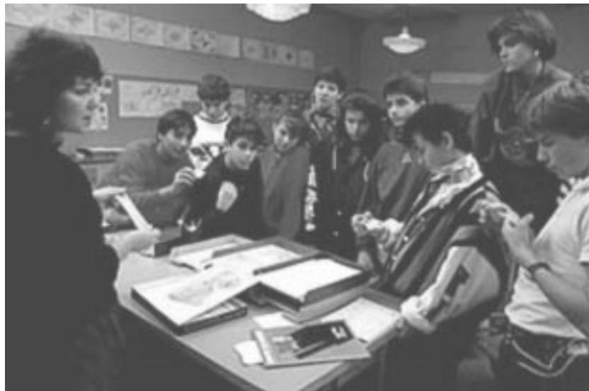
Learning about condoms