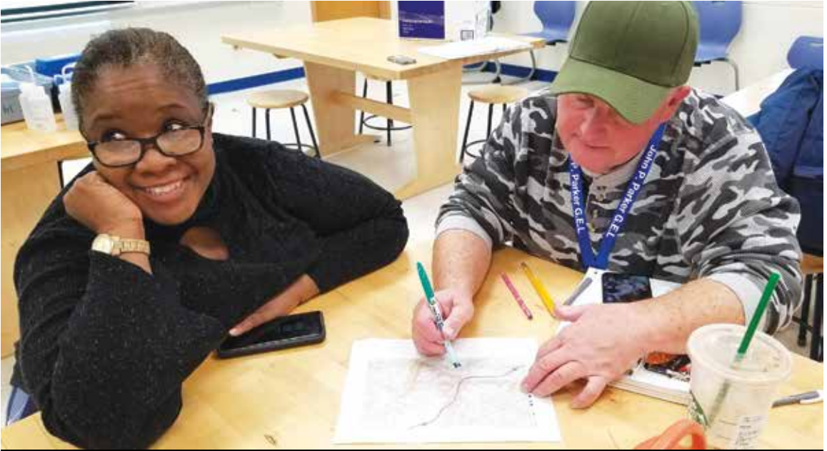
The Foundation for Ohio River Education used student funding to support environmental education for local teachers in urban school districts, who learned how to test water quality in streams within walking distances of their schools.

Cincinnati Chamber Music Society Cincinnati Community Toolbank Cincinnati Early Childhood Learning Centers Cincinnati Exchange Project Cincinnati Men's Chorus Cincinnati Museum Center Cincinnati Nature Center Cincinnati Observatory Cincinnati Opera Association Cincinnati State Community & Technical College Cincinnati Works Cincinnati Youth Collaborative Cincinnati Zoo & Botanical Garden Cinderella's Closet Citizen's Foundation, USA Citizens Policy Center CityCURE City Link Center City Heights Health Clinic