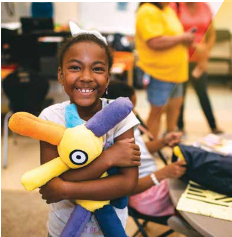
Sidekicks Made lets kids experiencing homelessness design their own stuffed toy, called a "Doodlie."

grant process less formal and more about the community we serve."