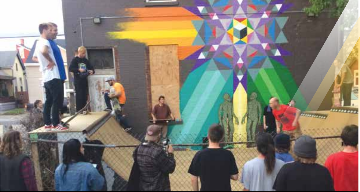
Graduate students PAD: 560 Planning and Community Development, worked with a Newport neighborhood to identify and fund a public art project, creating a mural beside a local skate park.

Lighthouse Youth Services Lincoln Grant Scholar House Literacy Council of Clermont and Brown Counties Literacy in Northern Kentucky Literacy Network of Greater Cincinnati Little Brothers: Friends of the Elderly Lovable Stables Lydia's House