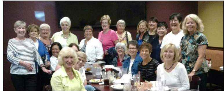
Lunch was enjoyed by all at Aubree's. Great pizza and salad!