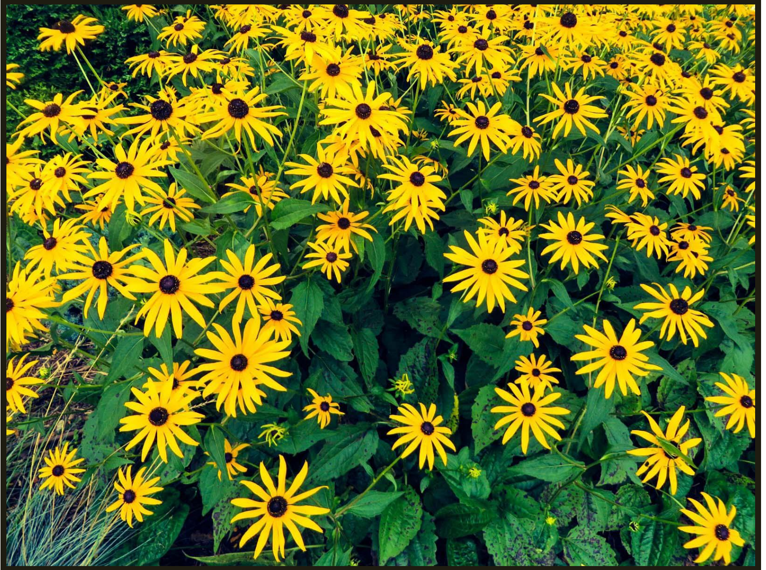
Black Eyed Susan's . . . . . photo by sue wittick