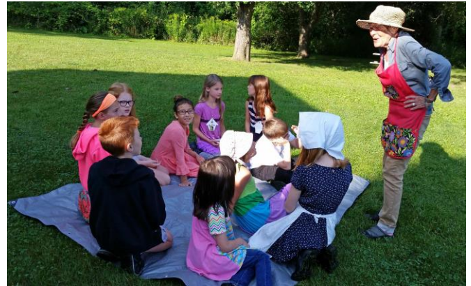
Students learning about gardening from a master!

The students also had other activities. They thinned our beets, turnips, and carrots. Each took home two turnips and the little carrots. We took the rest of the produce to Haven House. The highlight of the day was spotting a baby bunny in the garden - he will certainly have plenty to eat! The little gardeners also each planted a green bean seed in a peat pot to take home with them.