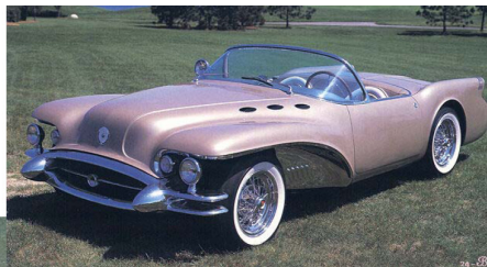
1953 Buick Wildcat II

The firm is currently producing the “789” which combines design elements of Chevrolet cars from 1957, 58, and 59. The company is taking orders on the Cobra-inspired Anteros. Stinger, based on classic Corvette elements, is in the planning stage.