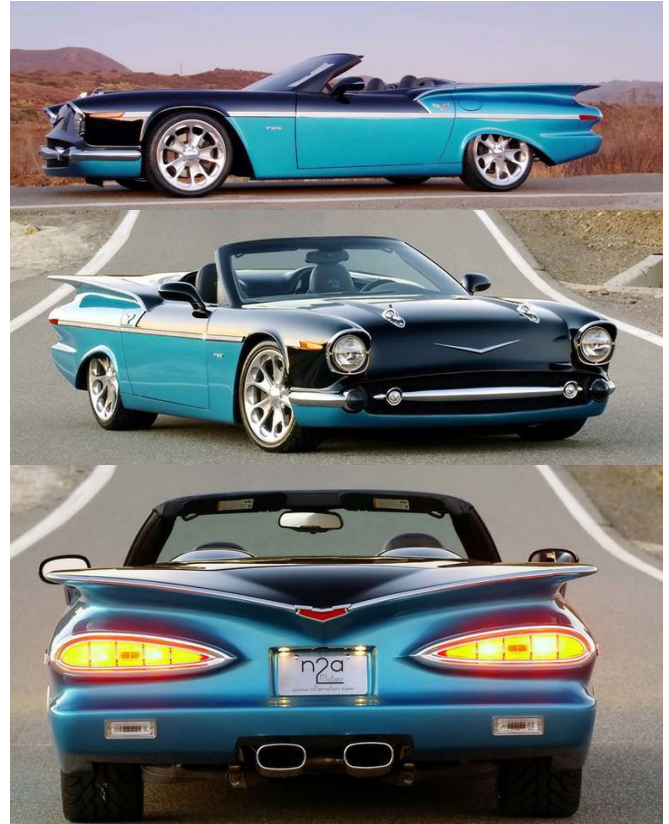
n2a Motors 789 model

“At n2a Motors no two identical vehicles are ever produced. We build everything in-house and make everything we need.”