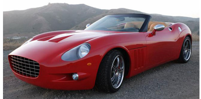
Anteros model from n2a Motors

While a running Wildcat doesn’t exist yet, Langmesser says he hopes to have a fully functional Wildcat ready for display at the 2009 SEMA show.