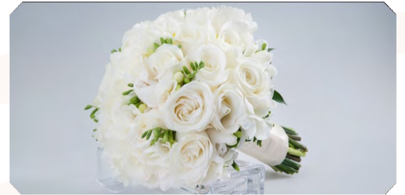
ONCE IN A LIFETIME