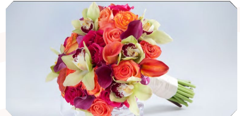
TROPICAL TRUE LOVE