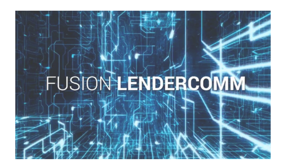
Fusion LenderComm Overview Video

Head of Digital for Corporate & Investment Banking, Natixis