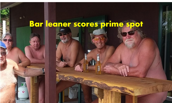
Bar leaner scores prime spot

visit and hand out chocolate goodies to all of us although we thought he was spotted again later disguised in full club uniform and mingling with the multitudes. It was notable that quite a few of these holiday makers spent a good portion of their time with full on relaxing in the sun, no doubt in preparation for the usual full house evening line up of punters wanting to join in the evening competition for “King” of the cards and get their initials inscribed in the “Book of Memories”