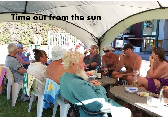
Time out from the sun

Christmas at WOS was celebrated in style with good numbers of members and visitors on site for most of the time -all adding something to the party atmosphere that prevailed over the festive period here. Naturally Santa dropped everything to pay us a brief