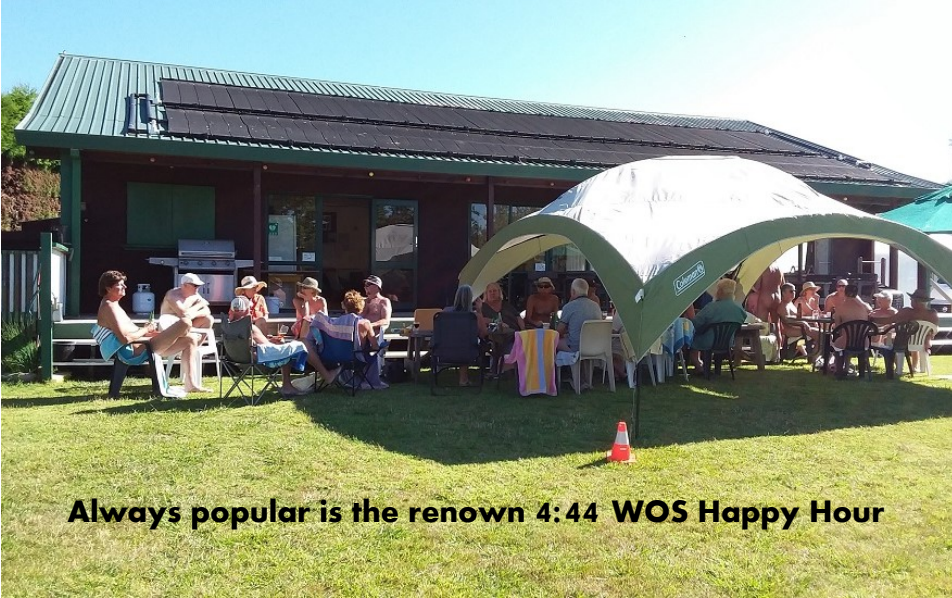
Always popular is the renown 4:44 WOS Happy Hour

Christmas at WOS was celebrated in style with good numbers of members and visitors on site for most of the time -all adding something to the party atmosphere that prevailed over the festive period here. Naturally Santa dropped everything to pay us a brief