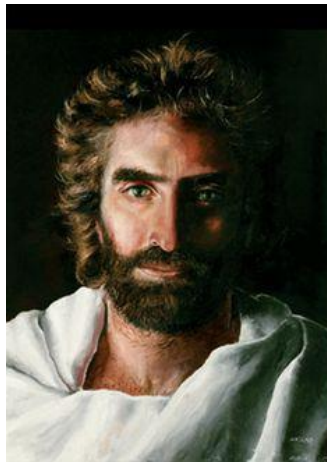
"Prince of Peace" by Akiane Kramarik, age 8

Prayers of Intercession. Each petition ends: Lord in your mercy. Hear our prayer.