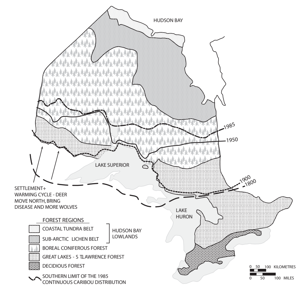
Fig. 2. The line of continuous distribution has moved northward since the end of the Little Ice Age as moose and deer moved north increasing the mortality of caribou through predation and disease. Hunting also contributed to the decline of caribou.

of nature view) and the abundant lichens were not sufficient to maintain numbers. The Slate Island population has persisted for 50+ years on an island archipelago in the absence of predators by foraging primarily on deciduous/herbaceous forage and ground hemlock; the presence of extensive lichens was not necessary for their persistence. In recent years these caribou have persisted despite considerable disturbance from power boats, canoeists, and kayakers.