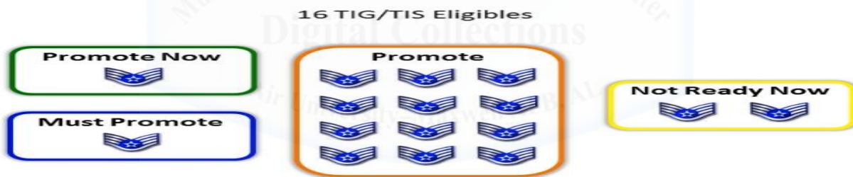
Figure 14: Top Recommendation Distribution at Small Unit 78