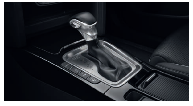
7-speed DCT (dual-clutch transmission)

The specified consumption and emission values were determined according to the legally prescribed measurement procedures set out in (EU) 2017/1153. The above values have been tested in the new WLTP, Worldwide Harmonised Light Vehicle Test Procedure, test cycle and converted back to NEDC, New European Driving Cycle, and additionally measured according to the RDE, Real Driving Emissions, method.