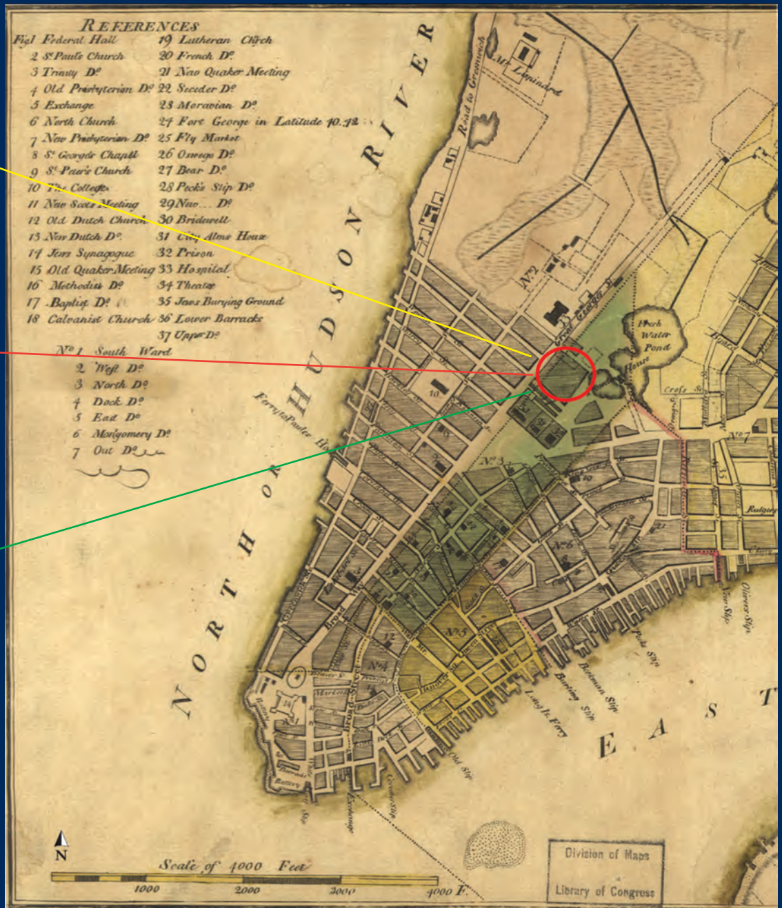
Top, Burial 12 (from The Skeletal Biology of the New York African Burial Ground, Part 2 ); middle, enslaved domestic laborers in eighteenth-century New York (illustration by Michael Colbert, 2004) (from Historical Perspectives of the African Burial Ground ); bottom, construction during archaeological fieldwork (photograph by Dennis Seckler); right, the Directory Plan of 1789, showing the city just before the closing of the African Burial Ground (Geography & Map Division, Library of Congress) (bottom and right images from The Archaeology of the New York African Burial Ground, Part 1 ).