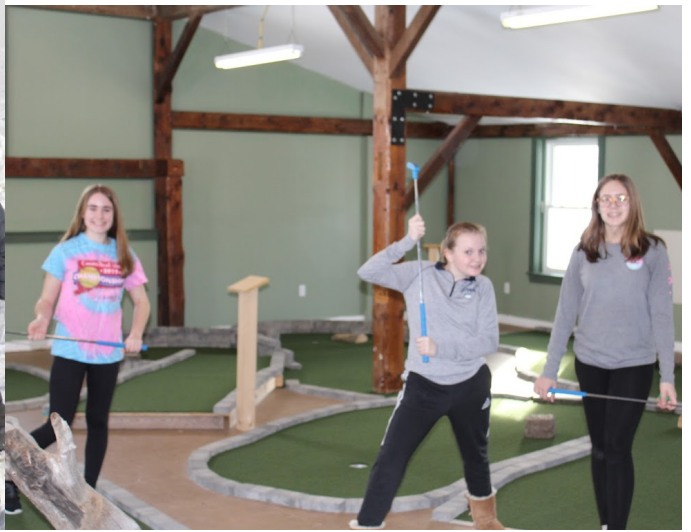
Pictures of some of our youth having fun inside playing golf and enjoying the winter crisp air.