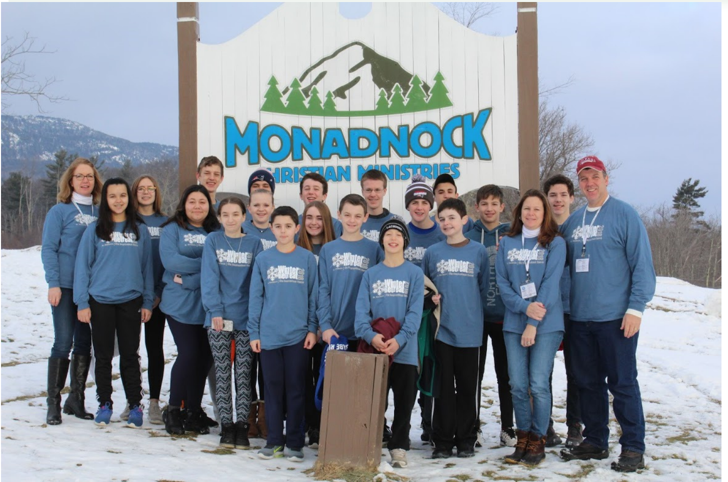
2018 Winter Youth Retreat