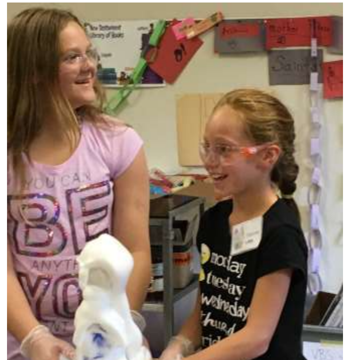
At Surf Shack, each day started with singing and dancing, included fun games outside, and nice & messy science experiments!