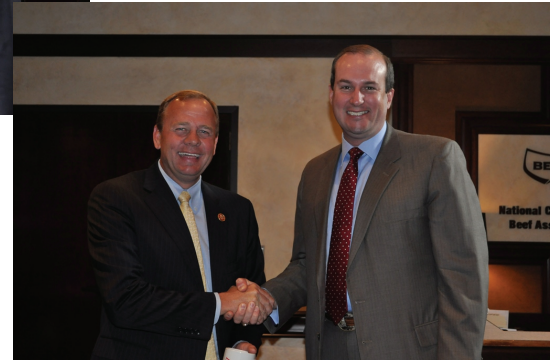
Rep. Steve Fincher (R-Tenn.)