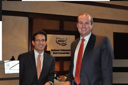
Rep. Eric Cantor (R-Va.)