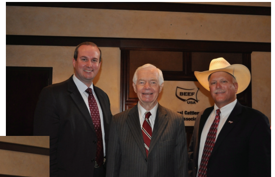
Sen. Thad Cochran (R-Miss.)