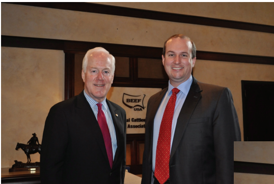
Sen. John Cornyn (R-Texas)