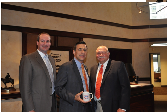
Rep. Darrel Issa (R-Calif.)