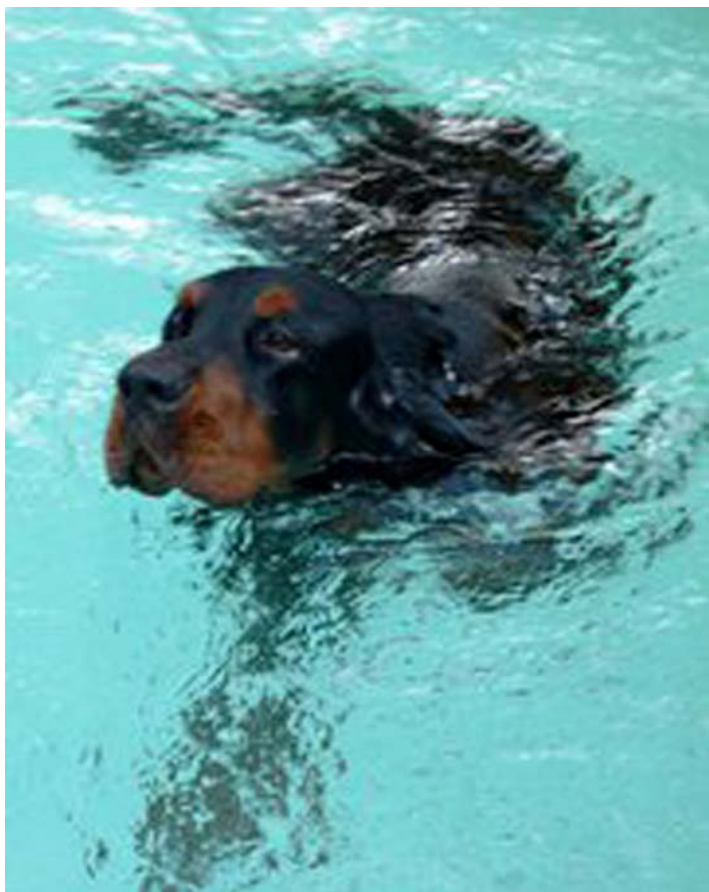
This is McGee - alias "Arrowoods Only Blue Skies" . He belongs to Rob and Dawn Mozgawa. He is 19 months old and is quite the swimmer.

What if you cannot find an older dog to assist in training? What are cross-species friends for but to help each other. That's right, you can take on the role of mentor. Use the tips I've given plus an abundance of common sense and you may succeed as well as that old dog in teaching new tricks! And, important too are dog-swimming-lesson safety tips for humans: Wear clothing that will protect your skin from accidental dog scratches and stay in shallow water as a panicked dog can drown a human. Train in quiet water away from river currents. If you water train in a swimming pool ( yes, some people do), be sure your pet knows the way to get out.