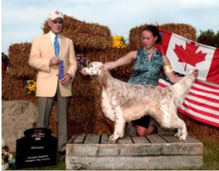
BJ'S FESTIVITY BUGATTI VEYRON ( Bugg ) (pictured left)