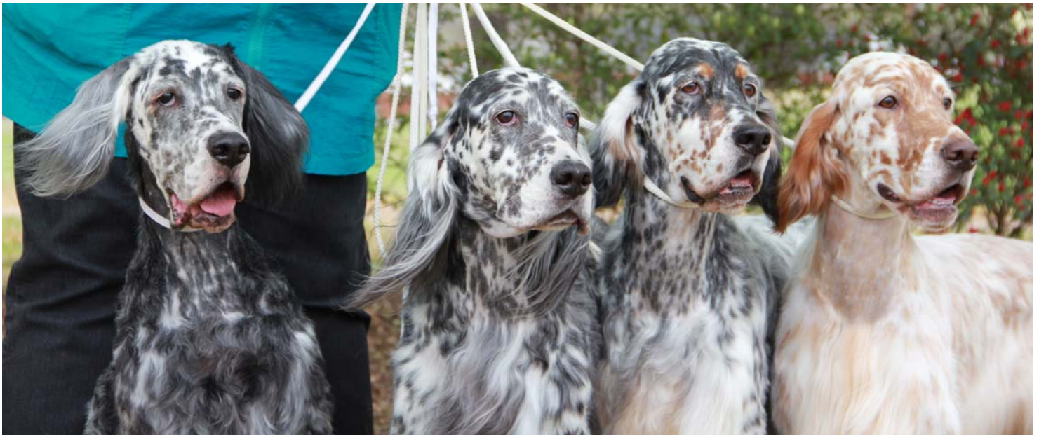
Barbie (Reigning Matriarch) Am. Can. Ch. Marmaladesown Limited Editions 14 Years