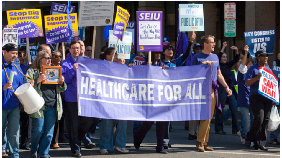
The Service Employees International Union played a key role in the passage of the Patient Protection and Affordable Care Act (Obamacare).

Not even AFL-CIO President, Richard Trumka, one of the President’s closest allies, could quiet his members. The best he could do was to prevent passage of a resolution