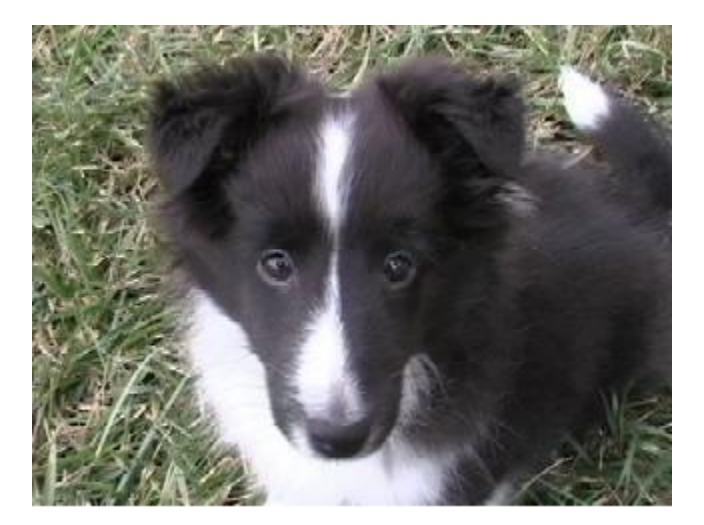
My puppy Jigger at ten weeks old. Note how he is sitting still for this photo. You can't see the treat I was bribing him with.

My purpose for writing this is to provide you with the proper information to train your new puppy. I want you to avoid the failures and frustrations that I experienced by equipping you with the steps needed to turn your puppy into a well-behaved, adult dog. Puppies need consistent training, discipline, and positive reinforcement from the moment they come home. This contains the techniques that I had success with, along with common training techniques that should be avoided.