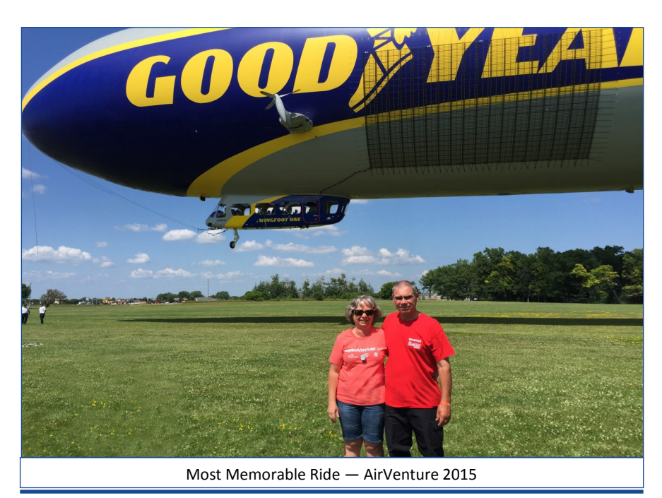
(Continued from page 3)

If so, then join us! Visit our website at www.eaa2.org and click on "Join EAA2"