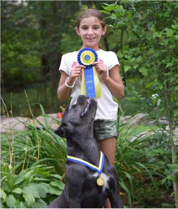
Junior Handler with a Cane Corso