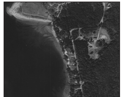
1944 (left) and 1961 (right) aerial images from UW Libraries. Images like these are used by PGST Natural Resources to assess bluff erosion and its impacts.