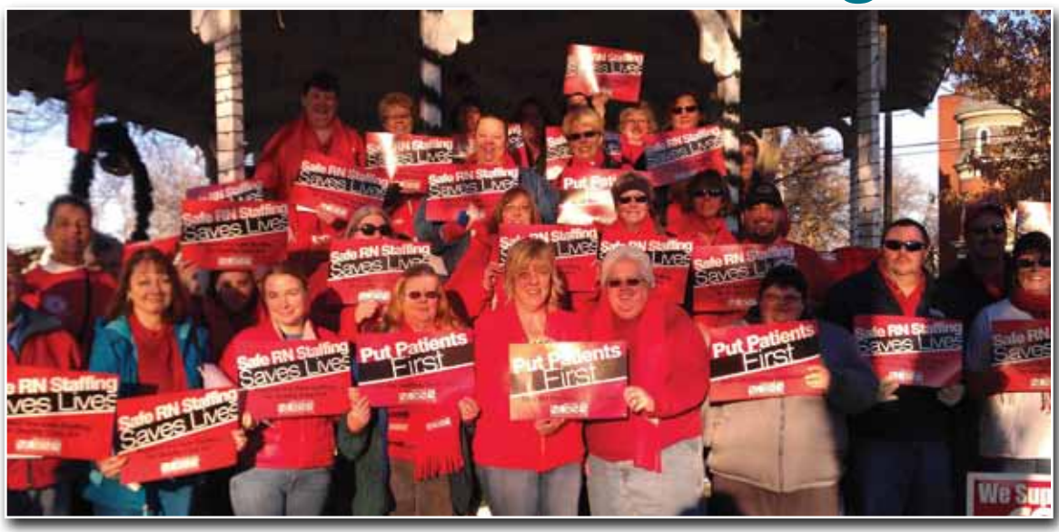
Community bands together: NYSNA members were joined by local CSEA members to rally for safe staffing in Olean.

Joining the RNs were members of the Western New York chapter of the Civil Service Employees Association and the