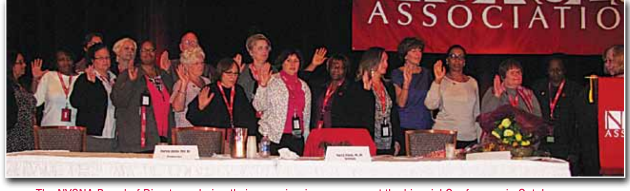
The NYSNA Board of Directors, during their swearing-in ceremony, at the biennial Conference in October.