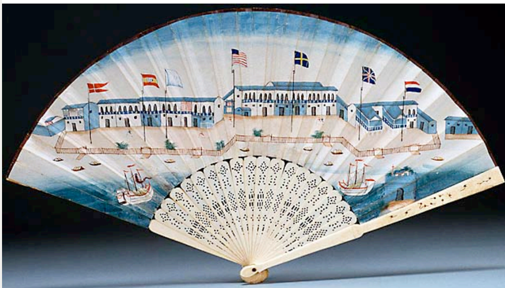
Canton, where the business of trade was primarily conducted during this period, is depicted on this fan created for the foreign market. Seven national flags fly from the Western headquarters that line the shore.

Under the system established by the Qing dynasty to regulate trade in the 18th century, Western traders were restricted to conducting trade through the southern port of Canton (Guangzhou). They could only reside in the city in a limited space, including their warehouses; they could not bring their families; and they could not stay there more a few months of the year. Qing officials closely supervised trading relations, allowing only licensed merchants from Western countries to trade through a monopoly guild of Chinese merchants called the Cohong. Western merchants could not contact Qing officials directly, and there were no formal diplomatic relations between China and Western countries. The Qing emperor regarded trade as a form of tribute, or gifts given to him personally by envoys who expressed gratitude for his benevolent rule.