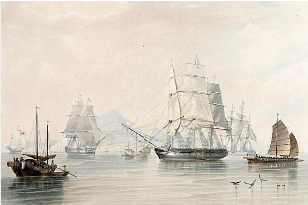
"The Opium Ships at Lintin in China, 1824"

Source: Jonathan Spence, Chinese Roundabout (Norton, 1992), pp. 233-35