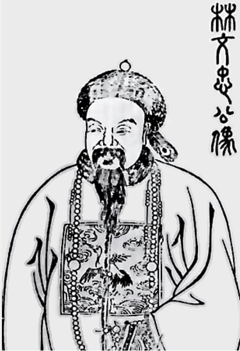
Right Lin Zexu painting by either Lamqua or Tinqu