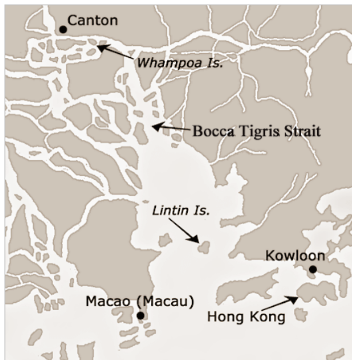
The Pearl River Delta

At Canton, Qing prohibitions had forced the merchants to withdraw from Macao (Macau) and Whampoa and retreat to Lintin island, at the entrance of the Pearl River, beyond the jurisdiction of local officials. There the merchants received opium shipments from India and handed the chests over to small Chinese junks and rowboats called "fast crabs" and "scrambling dragons," to be distributed at small harbors along the coast. The latter local smuggling boats were sometimes propelled by as many as twenty or more oars on each side.