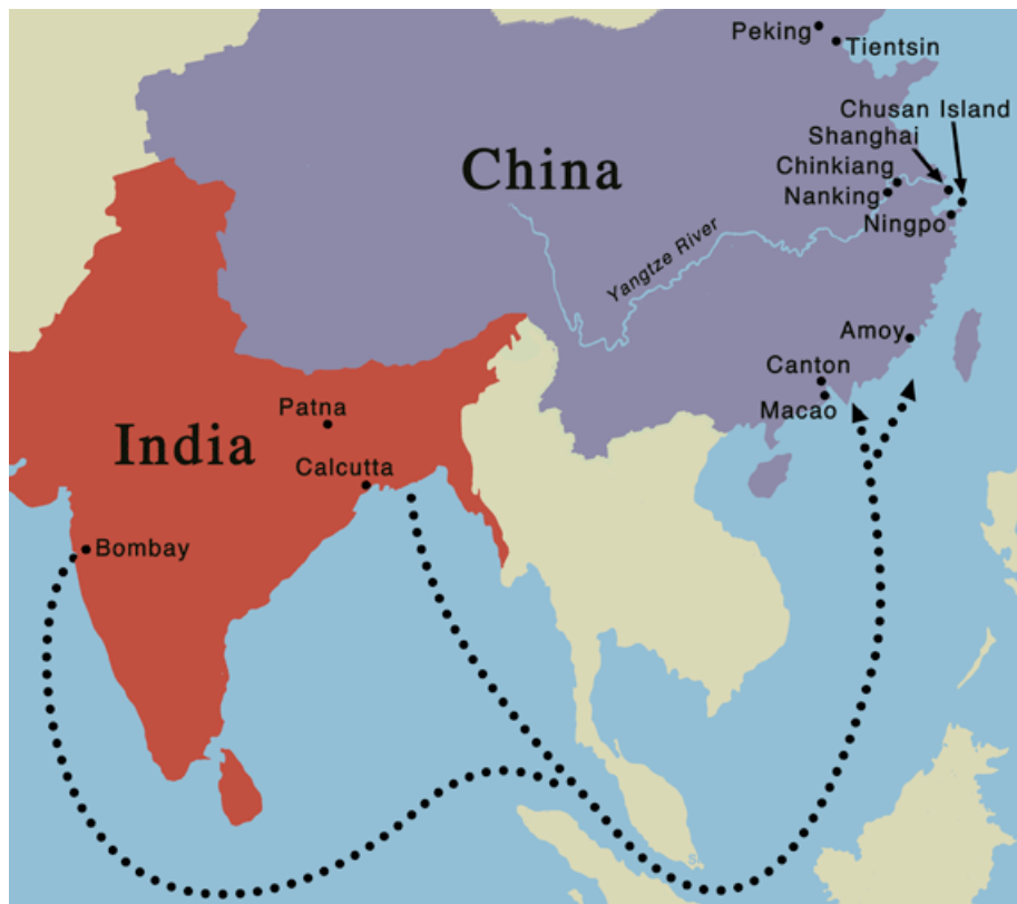
Opium routes between British-controlled India and China