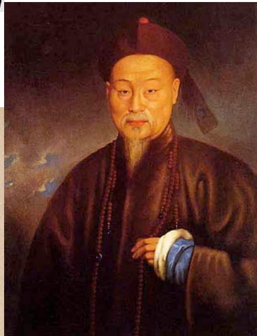
Left Lin Zexu, published 1843 From a drawing by a native artist in the possession of Lady Strange

Beinecke Library, Yale University [1800s_LinZexu_3454-001_yale]