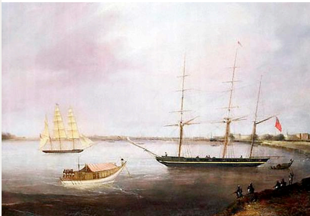
“The ‘Streatham’ and the opium clipper ‘Red Rover’”

The Streatham, an East India Company ship, is shown at anchor in the Hooghly River, Calcutta. Near the bank, the Red Rover, the first of the “opium clippers,” sits with her sails lowered. Built for speed, the Red Rover doubled the profits of her owners by completing two Calcutta-to-China smuggling voyages a year.