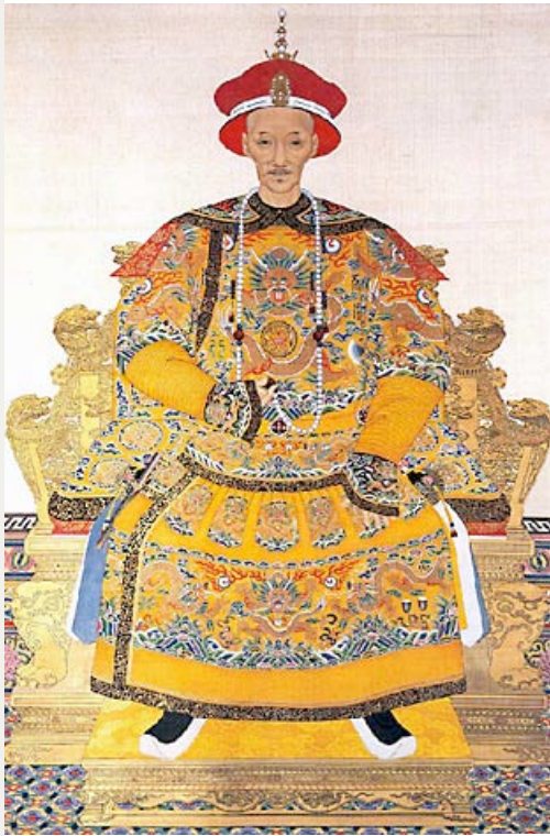
“The Imperial Portrait of a Chinese Emperor called Daoguang”

As opium infected the Qing military forces, however, the court grew alarmed at its insidious effects on national defense. Opium imports also appeared to be the cause of massive outflows of silver, which destabilized the currency. While the court repeatedly issued edicts demanding punishment of opium dealers, local officials accepted heavy bribes to ignore them. In 1838, one opium dealer was strangled at Macao, and eight chests of opium were seized in Canton. Still the emperor had not yet resolved to take truly decisive measures.