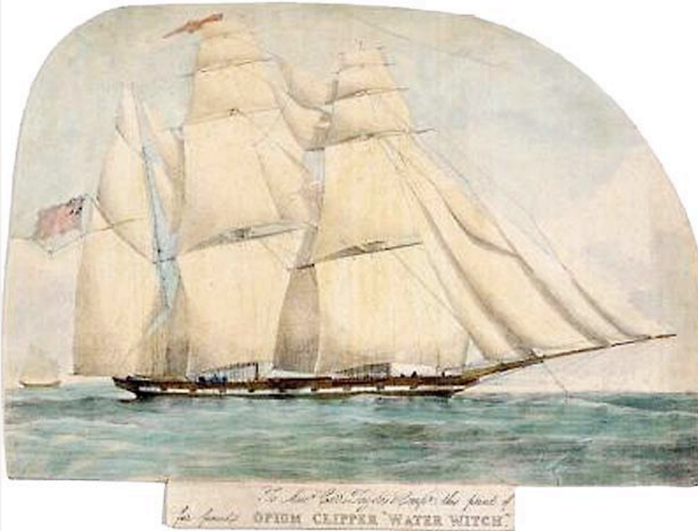
Opium clipper "Water Witch" (1831)

National Maritime Museum, London [1831_WaterWitch_PW7719_nmm]