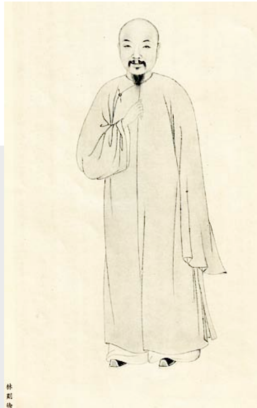
Left Lin Zexu from Zhonggou Jindaishi Cankao Tulu

Yale University, Sterling Memorial Library [1800s_LinZexu_yale]