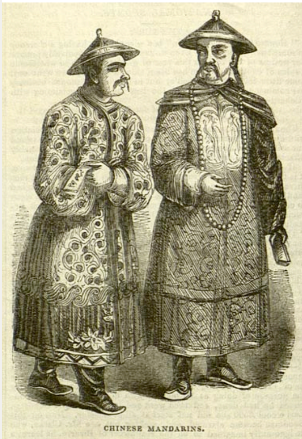
Chinese Mandarins, Illustrated London News, November 12, 1842

The opium trade was so vast and profitable that all kinds of people, Chinese and foreigners, wanted to participate in it. Wealthy literati and merchants were joined by people of lower classes who could now afford cheaper versions of the drug. Hong merchants cooperated with foreign traders to smuggle opium when they could get away with it, bribing local officials to look the other way. Smugglers, peddlers, secret societies, and even banks in certain areas all became complicit in the drug trade.