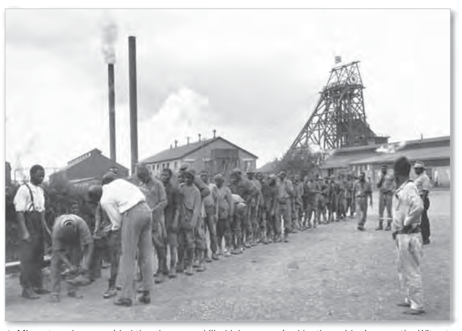
▲ Migrant workers provided the cheap, unskilled labour required by the gold mines on the Witwatersrand.