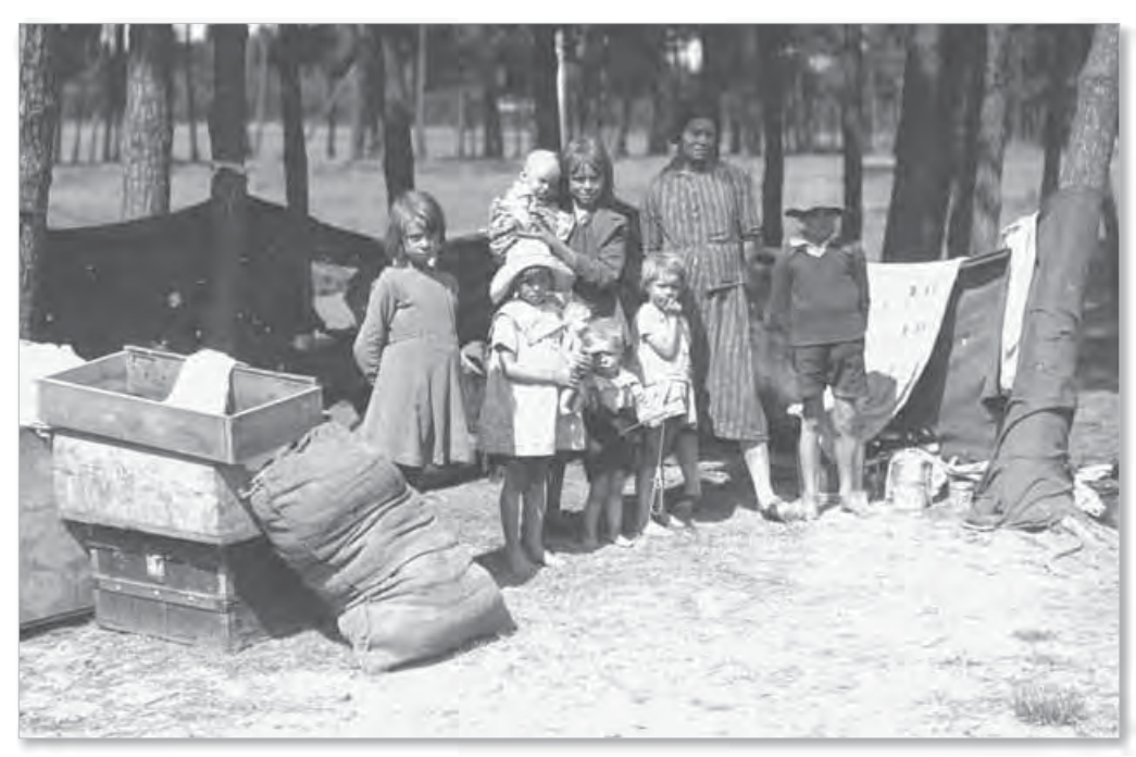
▲ An ordinary family affected by the Depression in the 1930s.

In explaining apartheid, social historians examine the role played by ordinary people in resisting the growing restrictions placed upon them. This resistance often led policy makers to pass increasingly harsh laws in order to control them. It also shows how poorer people of all races initially mixed in the cities and highlights the fact that racial mixing was more natural than racial separation.