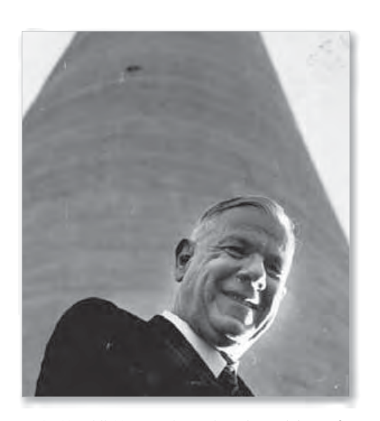
▲ Dr Hendrik Verwoerd was the prime minister of South Africa from 1958 to 1966 and is often given the title of the 'Architect of Apartheid'.

1. The Afrikaner Nationalist Approach Afrikaner Nationalists believed in the superiority of the Afrikaner nation. They believed that their identity was 'God-given'. They feared that the Afrikaner's very existence was threatened by the mass of Africans that confronted them in South Africa; that the Afrikaner nation would be swamped and overcome if there was continued mixing of the races. Afrikaner Nationalist historians explain apartheid in 1948 as the consolidation of these beliefs through a range of laws that were passed to prevent the mixing of the races and to preserve this 'God-given' Afrikaner identity.