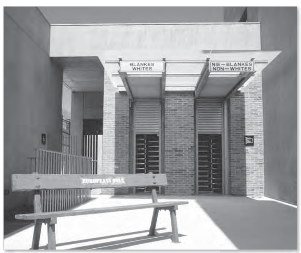
▲ The separate entrances to the Apartheid Museum.