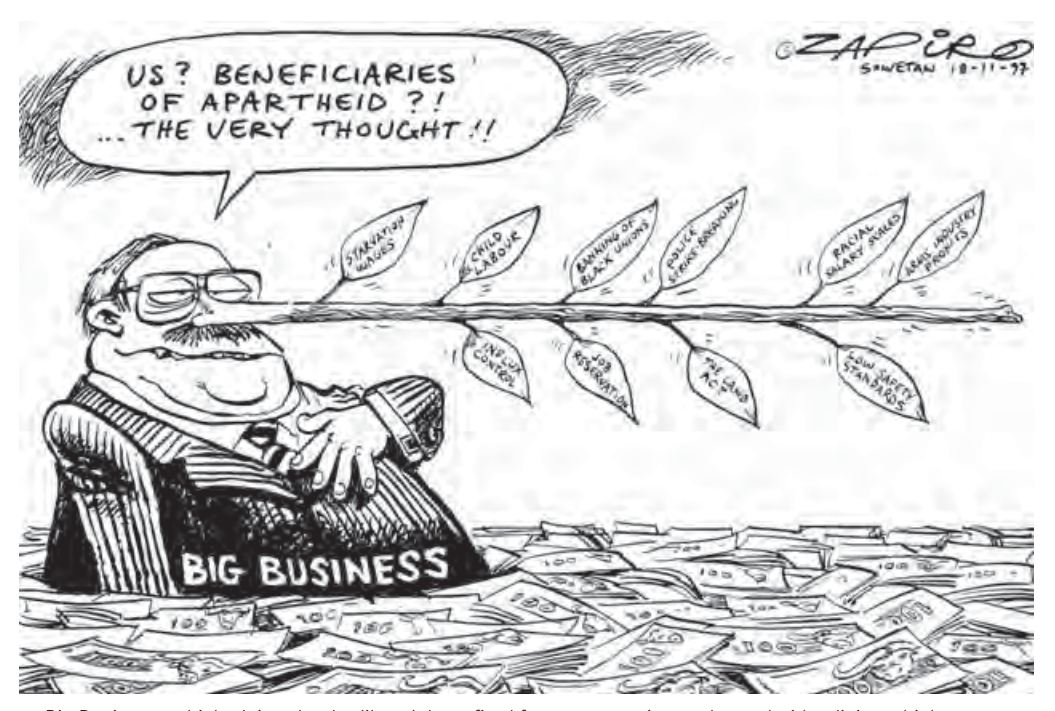
lacktriangle Big Business, which claimed to be liberal, benefited from segregation and apartheid policies which provided them with a source of cheap labour and greater profits. This cartoon suggests that Big Business was hypocritical. It portrays Big Business as a Pinocchio-like figure, whose nose grows longer with every lie he tells.

Liberals are opposed to racial discrimination and condemn apartheid as a form of racial hatred which dates back to very early struggles over the land. They deny that there were any economic benefits to be gained from apartheid and place the blame for apartheid on the National Party which came into power in 1948.