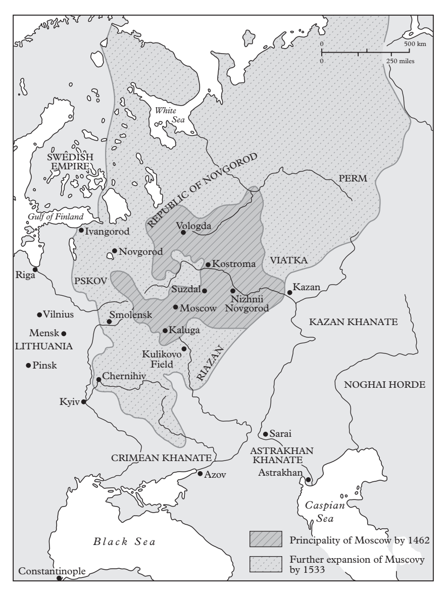
3. Muscovy in the fifteenth-sixteenth centuries