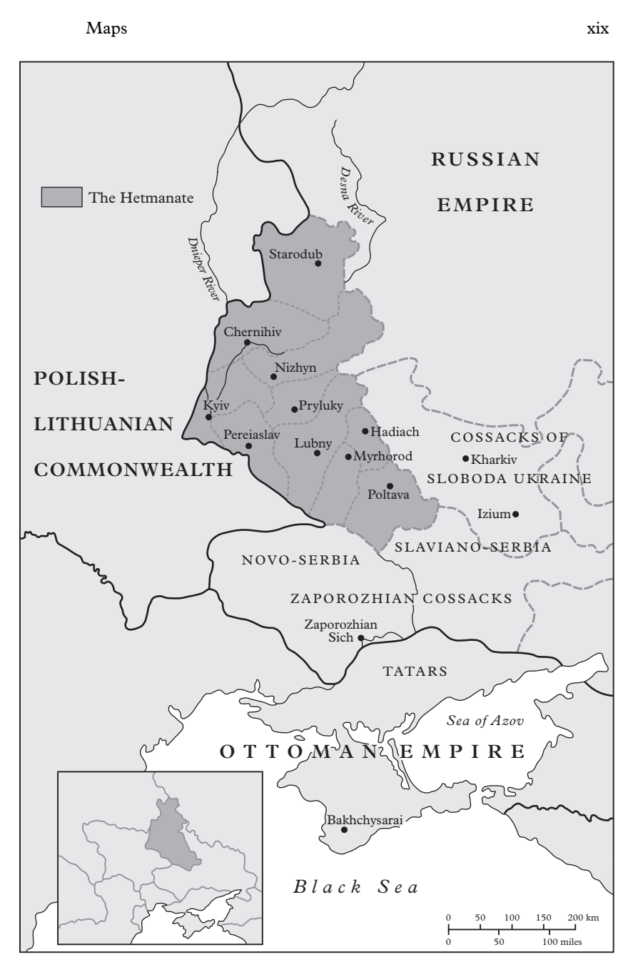
6. The Cossack Hetmanate in the mid-eighteenth century