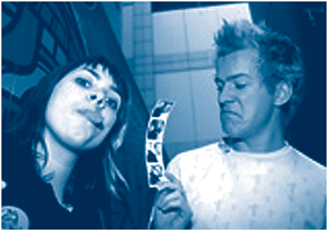
WELCOME 2 MY DEAF WORLD