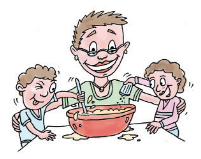
Illustration by Rob Foster

From pulling ingredients out of the fridge or cupboard to putting the finished dish on your plate, these recipes are all 30 minutes or less. Recipes in red ALSO only use everyday ingredients.