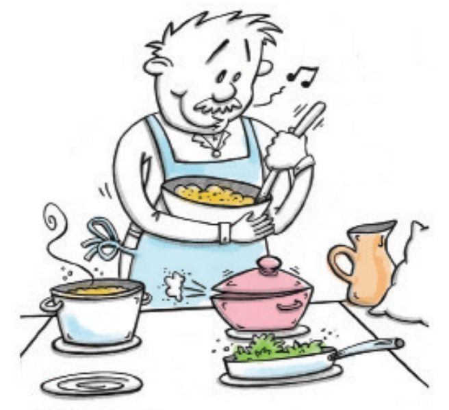
Illustration by Rob Foster