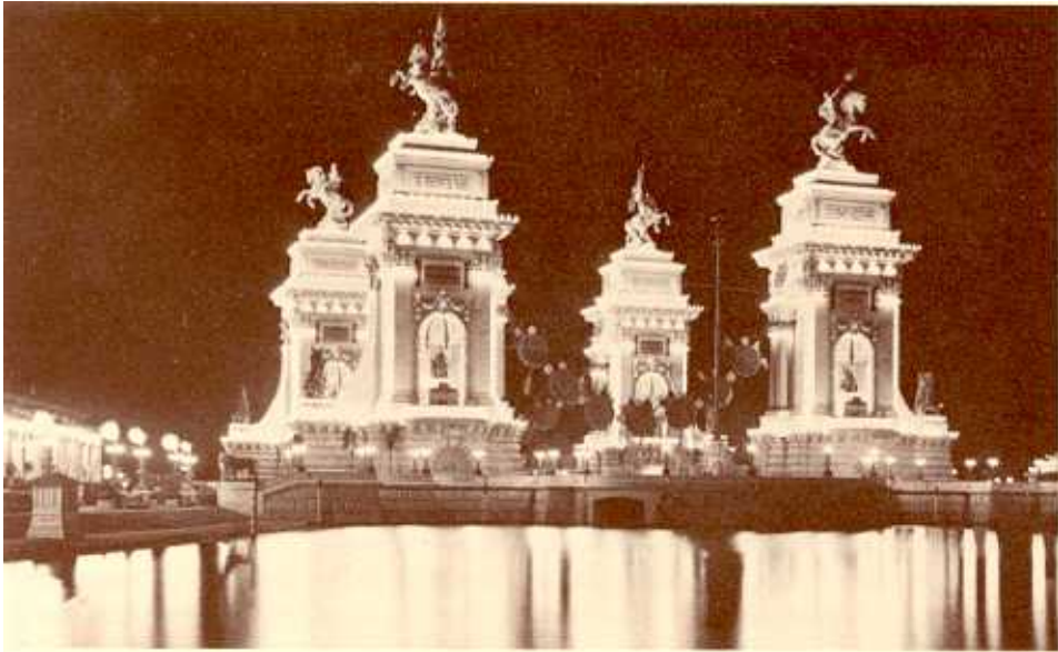
A night view of the Triumphal Bridge.

We have spent so many hours at the Exposition that it has become dark. Once again we must pay special honor to electricity, for the night time fairyland would not be possible without it. Many men