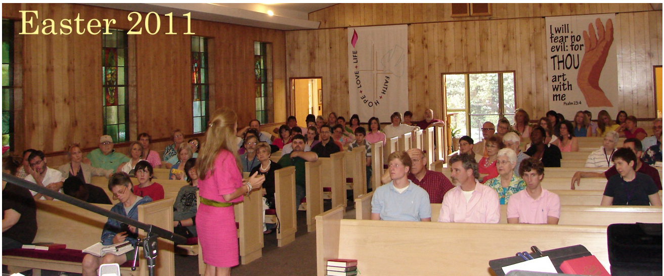
The Good News - June 2011