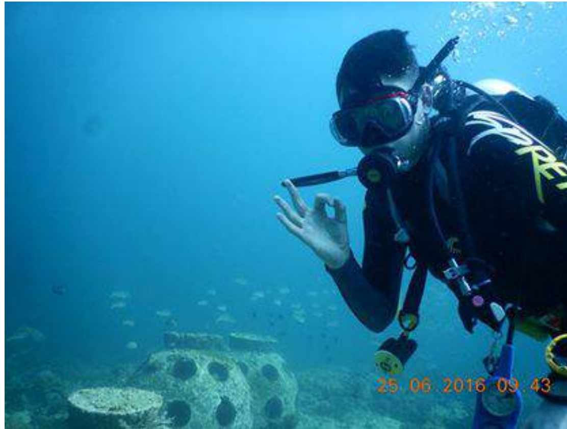
Hamburger Bay 25 June