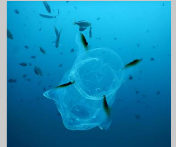
Tunicate Fahal Island 7 July