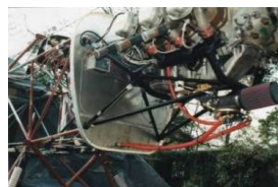
Continental O-300-D bottom & frame