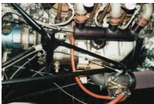
Continental O-300-D lower side