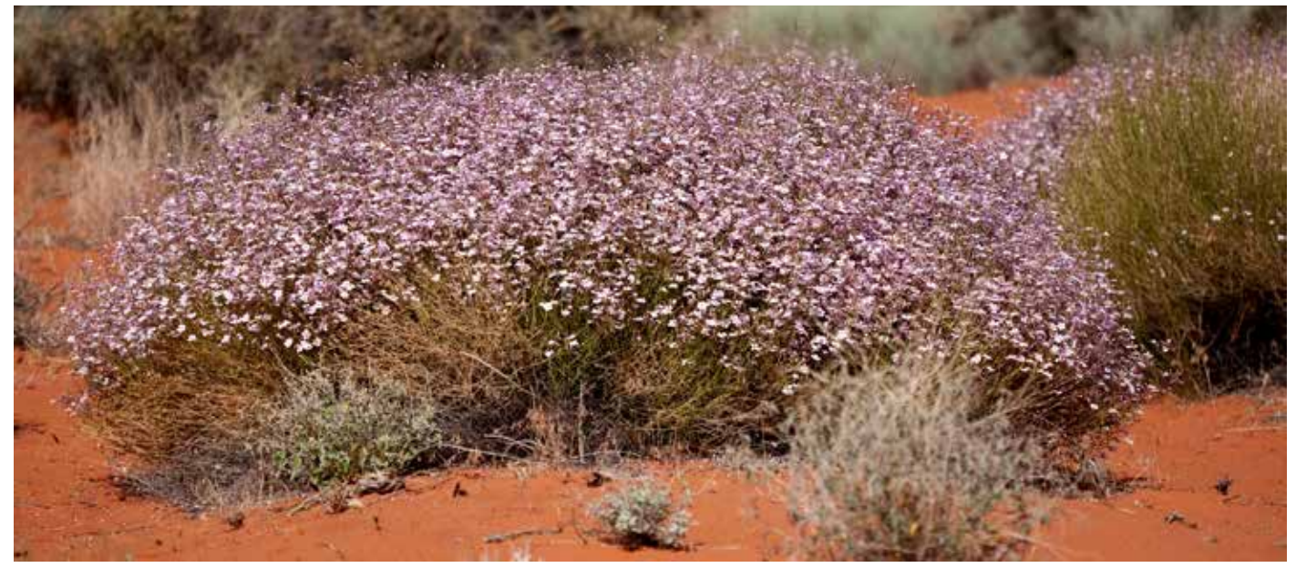
P. ambiguus, the sand pent, salverform flowers