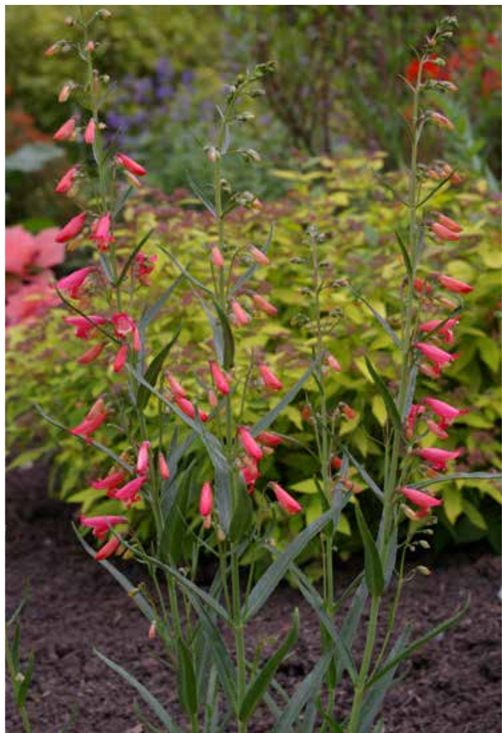
P. 'Schooley's Coral' from JoyCreek.com

Please , if anyone has seeds from either of these beauties, please mark them for collection and