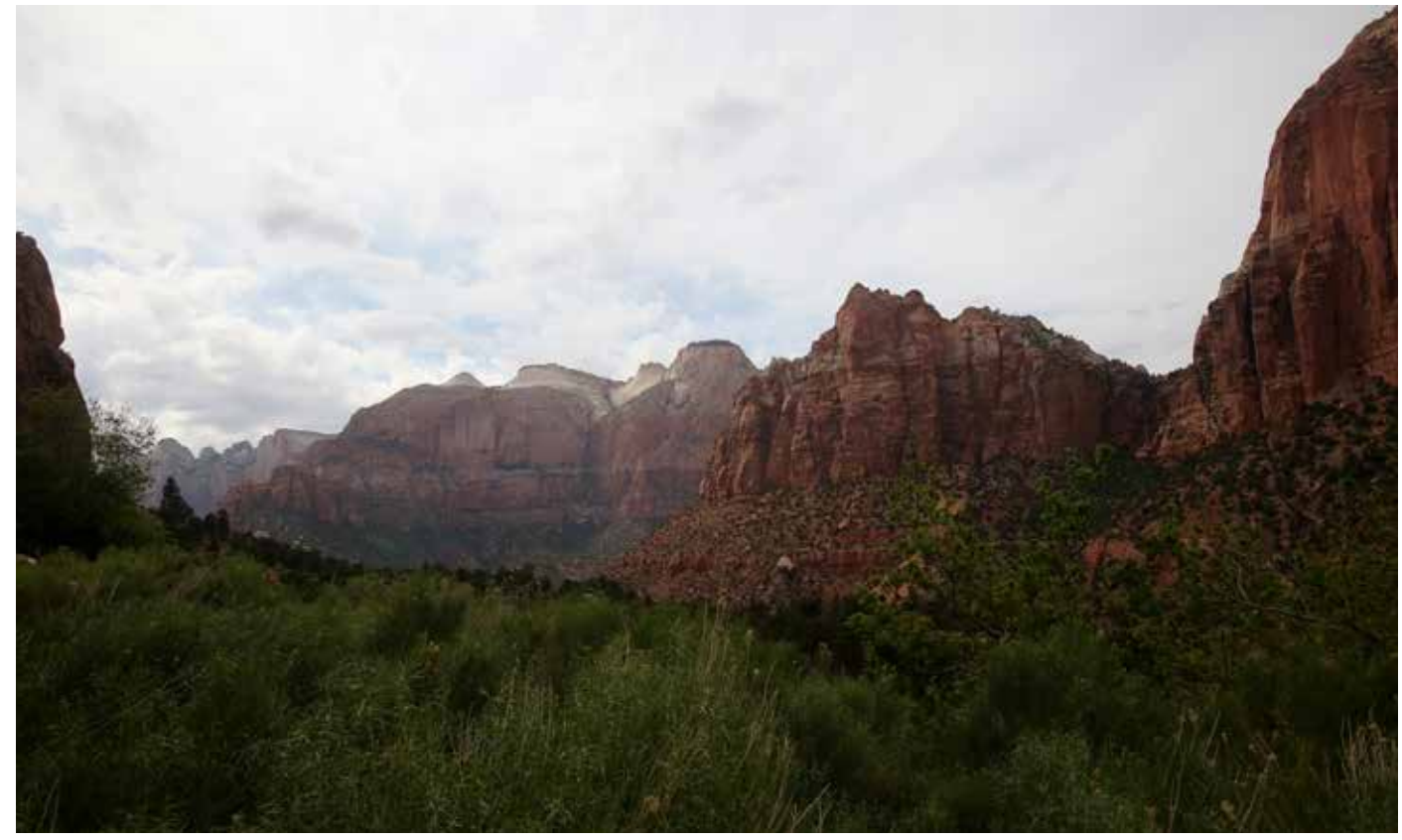
Long view, Zion National Park