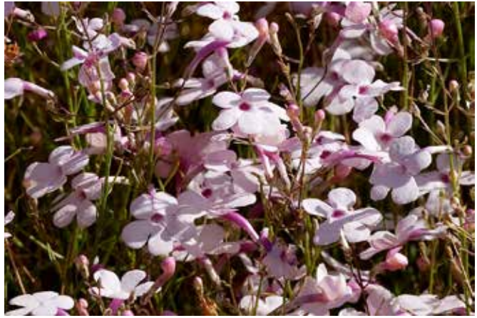
P. ambiguus.jpg