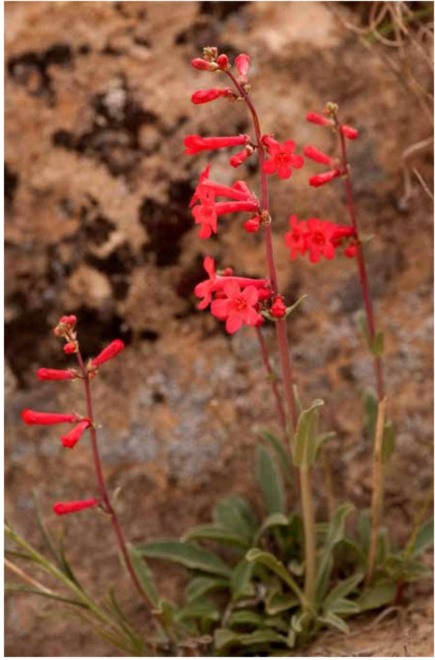
P. utahensis, Utah firecracker or bugler, in 4 states