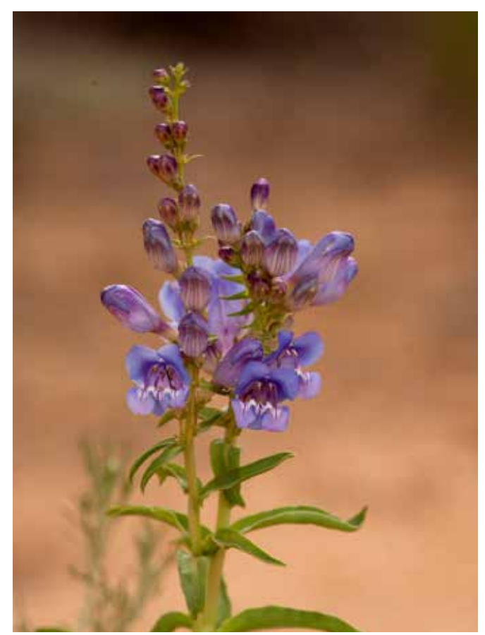
P. laevis, smooth pent, Kaibab Plateau

national park or monument in Utah (and is second only to Grand Canyon National Park in the Colorado Plateau). Zion's high species richness is a result of its location near the junction of four major floristic provinces: Colorado Plateau, Great Basin, Mojave Desert, and Rocky Mountains. About 50 species are only found in the park or in neighboring areas of southern Utah. Mid-May is an optimal time to observe desert wildflowers in the park's canyon bottoms and higher elevation species on slickrock trails and mesa tops. Shady canyons and hanging gardens support their own unusual floras, rich in ferns, orchids, shooting-stars, and other showy species.