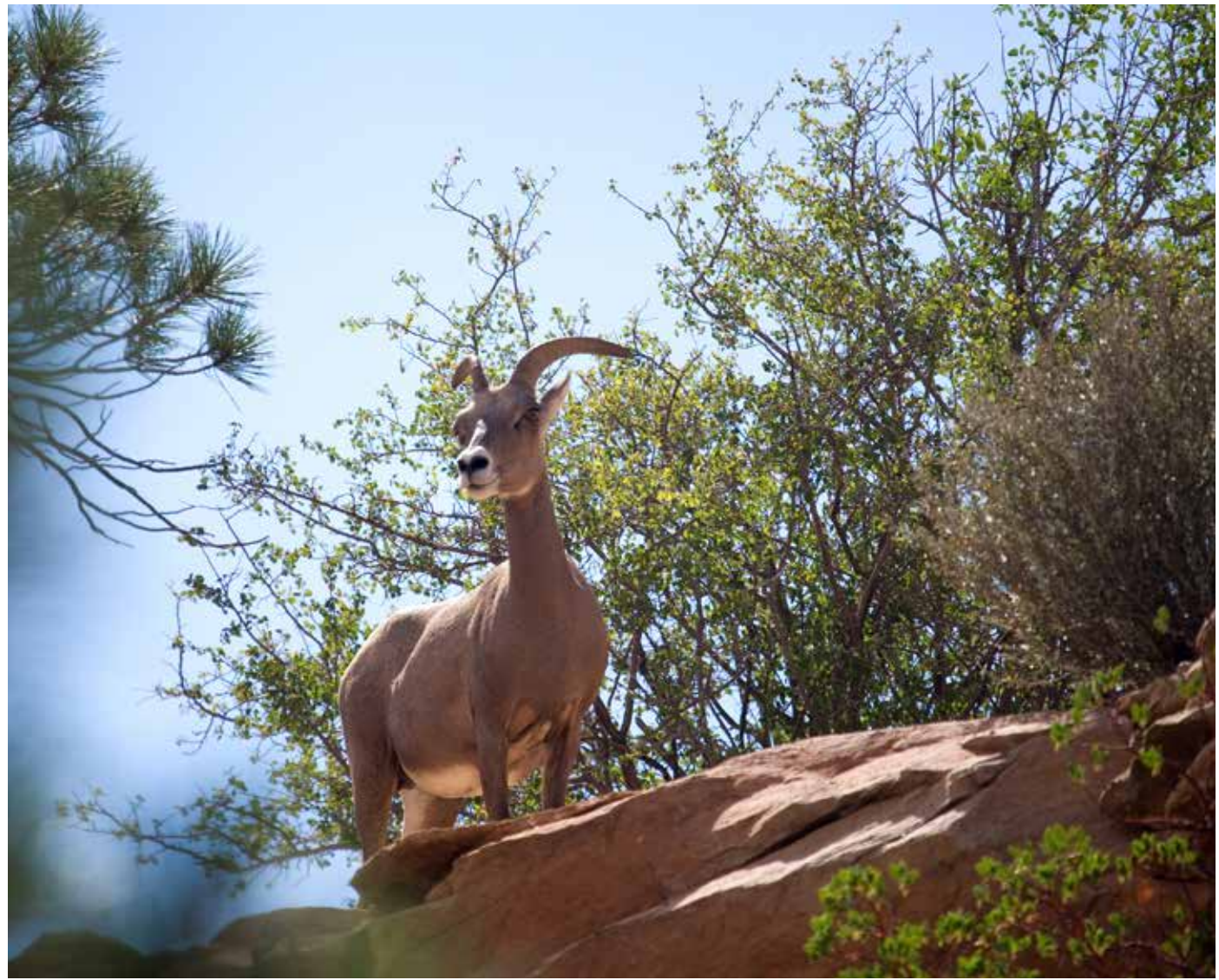
Big horn sheep, Zion National Park

Efforts to refine the Penstemon treatment have continued: thousands of new distribution records have been accumulated from herbarium studies, many morphological data missing in the draft have been obtained thanks in part to APS members who provided material for examination, and discussions and keys have been improved. I hope to work through review comments and technical edits for the treatment this coming spring or summer. If we receive the last five treatments and have a little luck, Volume 17 may be on its way to press late this year. After the bulk of the work for FNA has been completed, I hope to explore ways to make some of the ancillary products of my work available through the APS website, such as regional keys, distribution data, descriptions, and other items of interest. I am grateful for the continued support, encouragement, and assistance of APS members, and I look forward to completing the treatment.