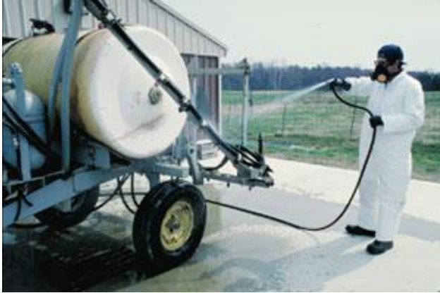
Personal protective equipment (PPE) must be worn when maintaining and cleaning all spray equipment

To begin the winterization process, the sprayer should be thoroughly washed inside and out and any rinsates may be able to be applied to a labeled site. Nozzles, screens and filters should be removed, cleaned and stored in a plastic bag or sealed container in a warm area. Metal parts should be stored in vegetable or light oil over the winter. The sprayer should be cleaned with an appropriate cleaner and rinsed two to three times. It is recommended that the lines be blown out with an air compressor to remove as much remaining water as possible. Remove pressure gauges, plug openings and store indoors in an upright position. Antifreeze can be run through the system as long as it can be collected from the boom lines. Otherwise turn off boom lines when moving antifreeze through the system. Antifreeze may be left in the system or largely removed if it can be recaptured. Most recommendations suggest automotive antifreeze and water at a 50:50 concentration since it is less corrosive, although RV antifreeze may be used at 100% and may be released onto the ground. Recaptured antifreeze can be reused for two or three years. Consult the pump manufacturer's instructions for proper winterization to not void any warranties. Pressure regulators should be released, and any O-rings should be removed and stored indoors. Ideally the sprayer should be stored undercover with all openings plugged, and the unit covered