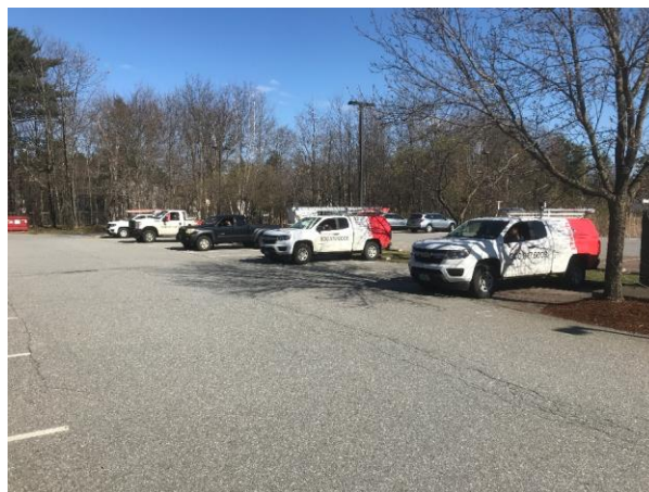
Spring Parking Lot Exams, Williston

any one location, which would in turn, reduce the number of potential interactions while allowing: essential services to continue their food production and crop protection; provide protective services to other essential service providers; comply with state and federal regulations; and provide general health related insect-disease vector protection.