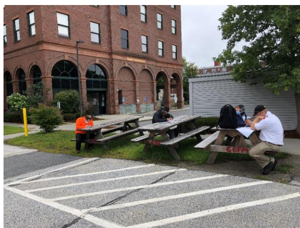
Summer Picnic Table Exams, Montpelier