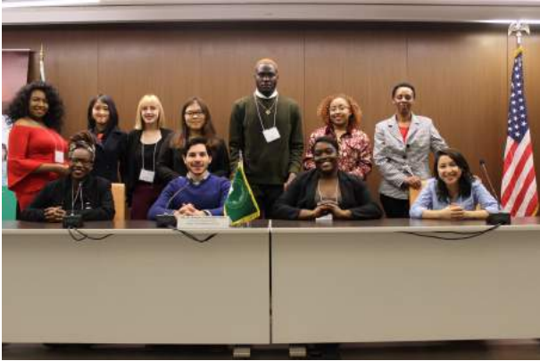
The Delegates for Cote D'Ivoire and SADR at the African Union Briefing

Hosted by Howard University Washington D.C.