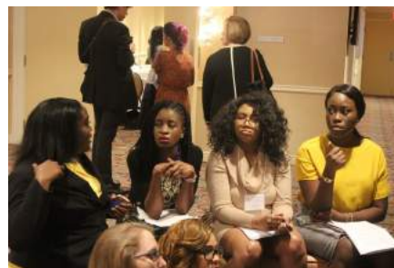
The Delegates from the Social Matters Com- mittee having discussions during an unmoderated caucus