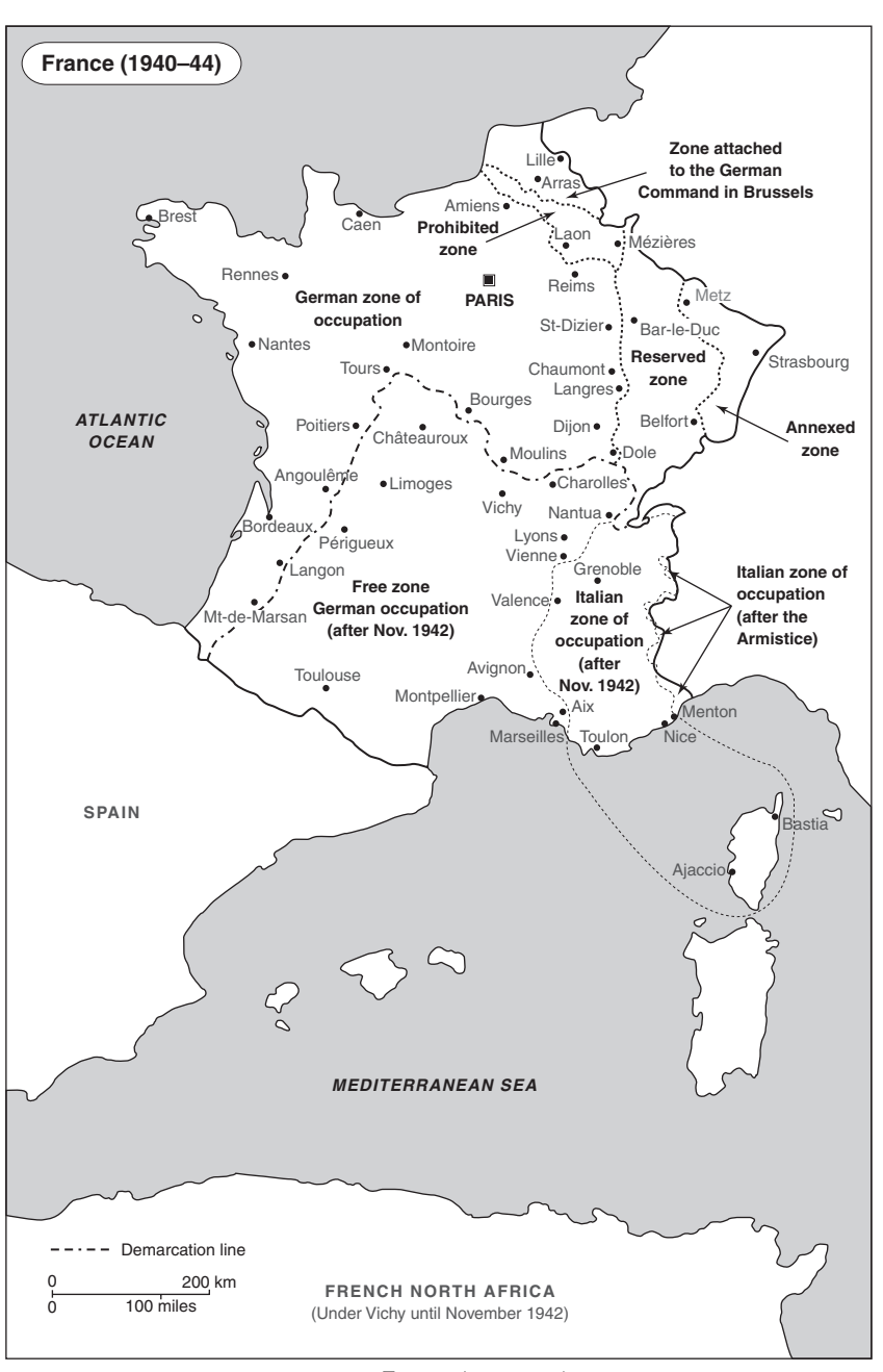
MAP I. France (1940-44).