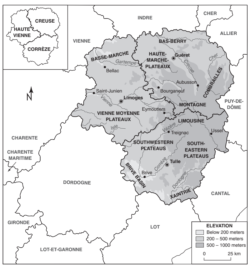
MAP 3. Limousin region.