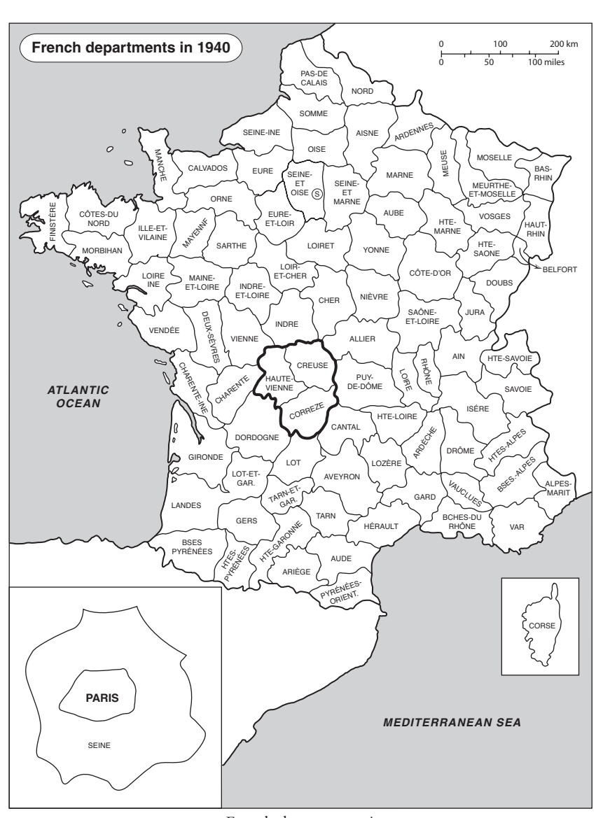
MAP 2. French departments in 1940.