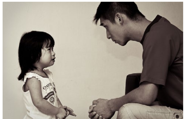
Discipline

At home, parents who knew how to deliver respectful Nos to their children would see a lot less destructive strife, and their children would be less spoiled and much happier, as children are when they grow up with firm respectful limits. Those who are in troubled relationships would find that their marriages and their friendships have a much greater chance of succeeding. In the workplace, managers and leaders who knew how to say No would do a better job of keeping their organizations strategically focused. People in the finance, legal, information, and human resources departments who regularly have to say No to internal clients would be able to contribute more effectively to the organization’s strategic objectives.