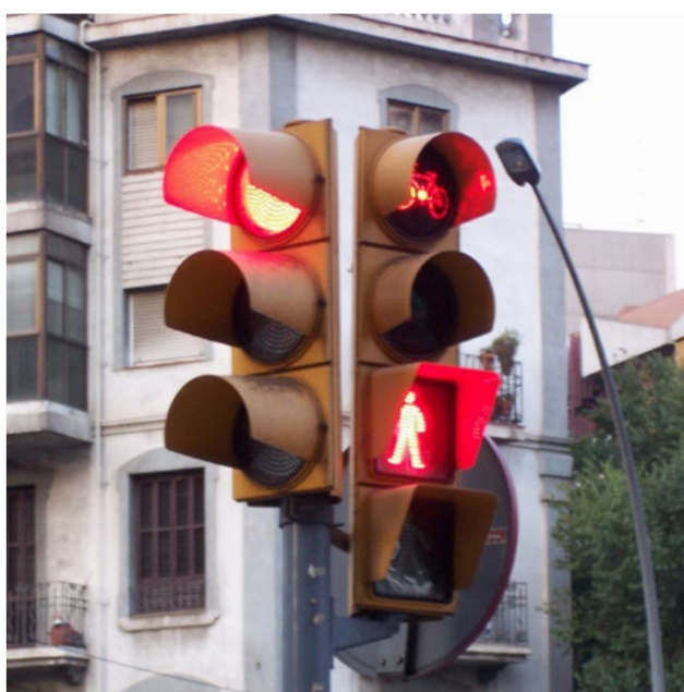
All Stop

Saying No positively means first of all saying Yes to yourself and your own deepest needs and values. When one executive I know in a family business had to say No to his father and boss's demand that he take care of the business over the Christmas holidays for the Nth year in a row, he drew on a deeper underlying Yes to his family and his self-respect. He told his father: "Dad, my family needs me and I intend to spend the Christmas holidays with them."