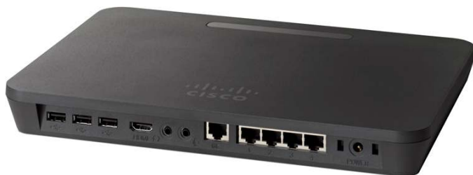
Figure 1. Cisco Edge 300 Digital Media Player

The Cisco Edge 300 Digital Media Player supports single-touch interactivity by interfacing with popular touch screens. It can be managed through the network at a centralized location and is fully manageable as a standalone device. As a high-performance Cisco digital media player, it is a powerful, customizable digital media publishing endpoint. Using the Cisco Digital Media Partners, the content management solution vendors, you can flexibly and remotely publish centralized content to networked digital displays. You can attach the Cisco Edge 300 Digital Media Player to virtually any on-premises digital display at any location - for example, in a branch-office bank, retail store, break room, or lobby-across any geography.