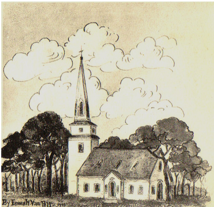
First Church Building, 1738