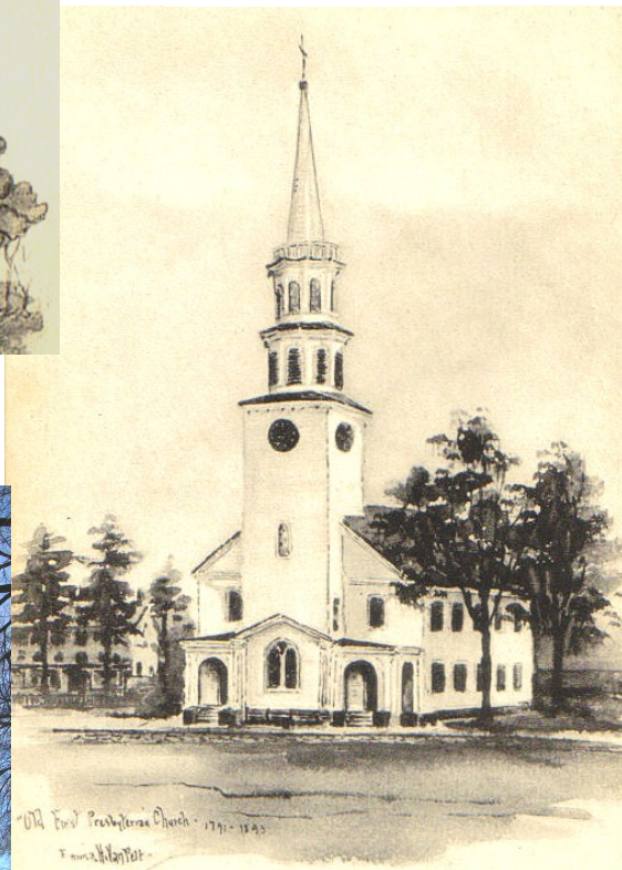
Second Edifice, 1793